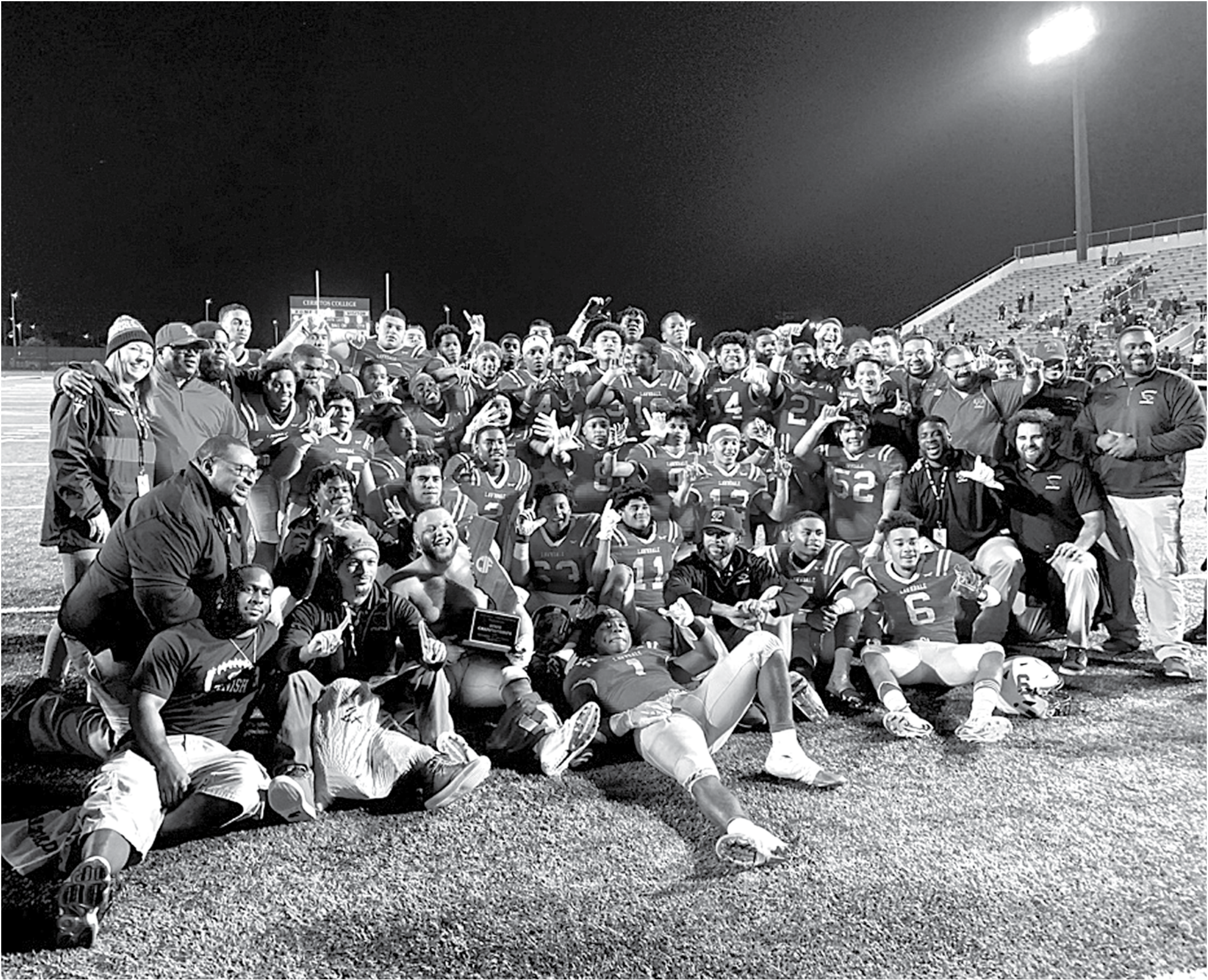
The Lawndale High School football team will be honored by MaxPreps and the National Guard for being named top 50 in the nation. The Cardinals ended the year as CIF State Division 2A champions. Additionally, they won the CIF Southern Section Division 5 championship and the CIF State Southern Regional Division 2A championship. The trophy presentation takes place tomorrow, Feb. 8, at 2 p.m. at the Lawndale High School Football Field.