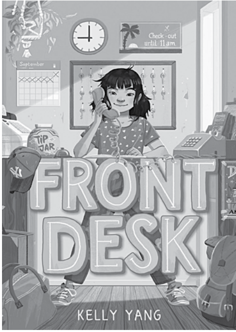
Front Desk by Kelly Yang.