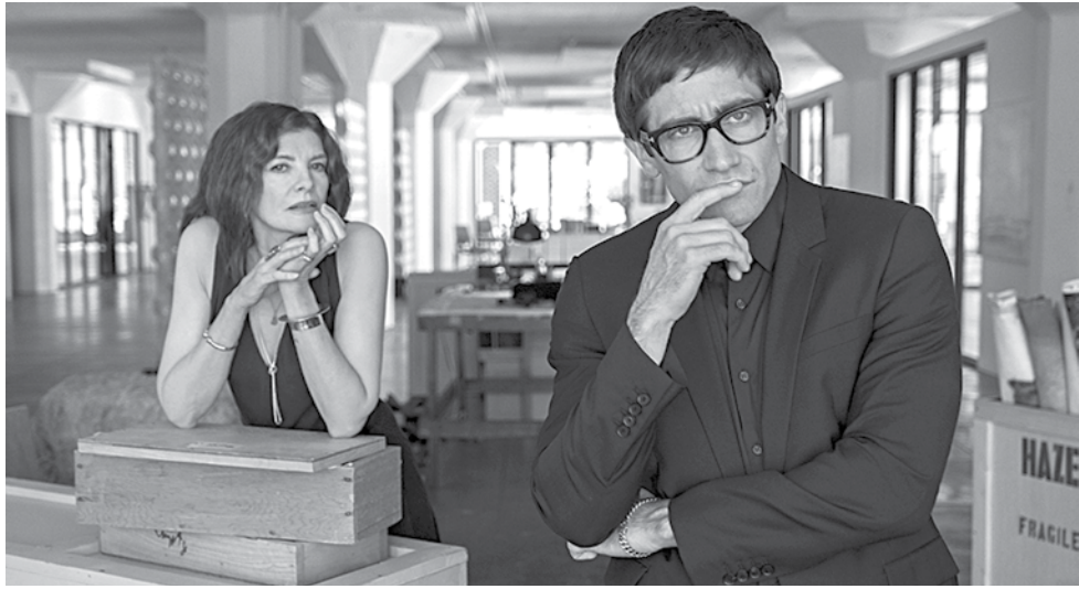
Velvet Buzzsaw