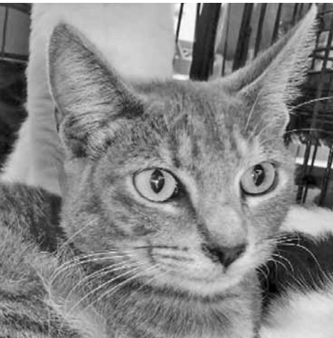
Aurora is looking for a home with other cats.

NaNa was found walking down the street in Long Beach as a very small kitten. NaNa is still a bit timid with humans moving around, likely from her time spent on the mean streets of Long Beach. She loves to snuggle on your legs when you are on the couch, and will even ask for pets when you are in bed. NaNa loves to play with toys, so if you sit down and get out a wand toy she will come