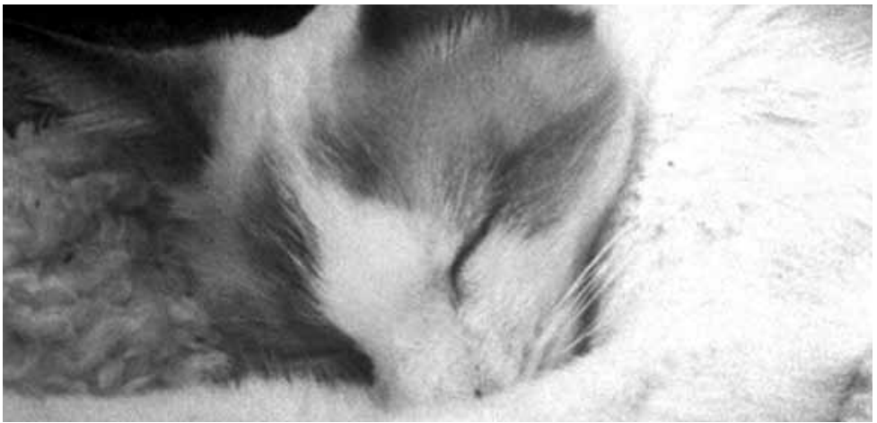
NaNa needs a calm environment.

right over for some fun. She also really likes treats and will just about take them from your hand! NaNa loves other cats, but would be ok as an only if you are home a lot as well as she is very independent. Teenagers who are calm and understanding of her timidity would be ok, but she likely would do best in an adult home. NaNa is a very special, sweet girl who deserves a loving home who will cherish her.