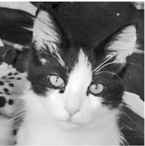
Rascal loves to chase toys and cuddle!

Looking for your purr-fect match? Kitties of every color and size waiting to meet you.