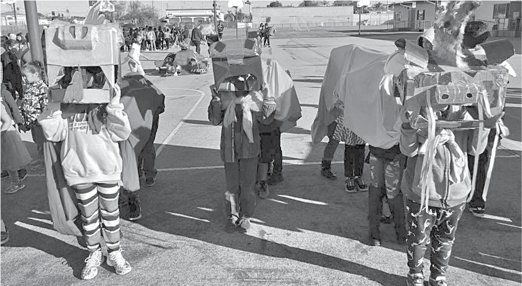
Students at Billy Mitchell Elementary collaborated with students from Jane Addams Middle School to create over 40 life-size dragon heads in celebration of Chinese New Year.