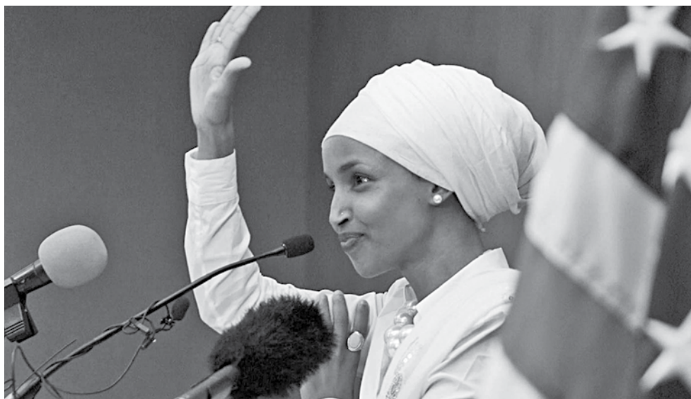
Time For Ilhan

Ilhan came to America as a refugee and now stands alongside other political heavyweights in Congress. Personal beliefs and party politics aside, her journey is one that should be admired, respected and continuously told. Ilhan serves as an inspiration for all