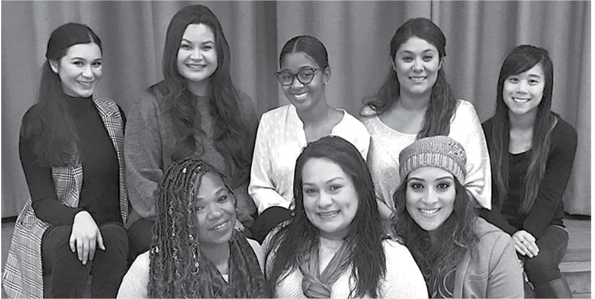
Lawndale Elementary School District celebrates its social workers this month. Each March, National Social Work Month recognizes the contributions of these individuals.