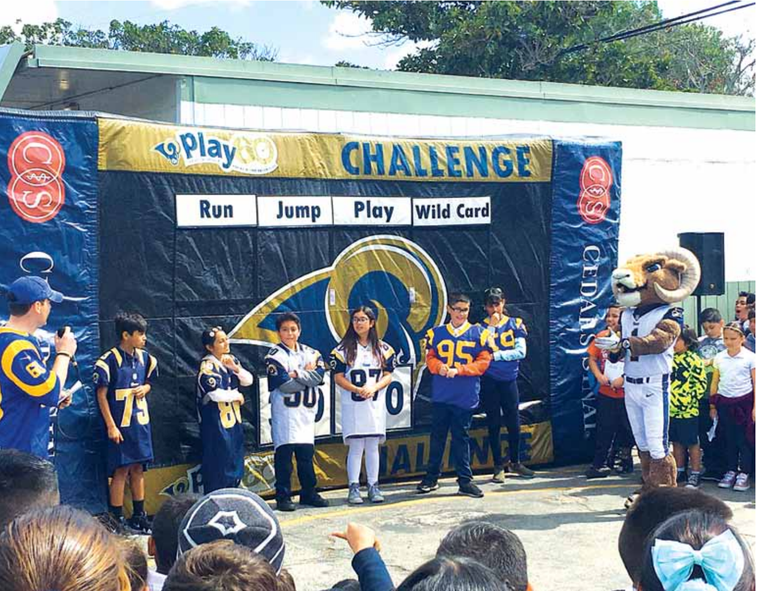
Last week, the Los Angeles Rams visited Inglewood’s Worthington Elementary School to host a Play 60 assembly promoting health and fitness. Centered on the unique Play 60 Challenge inflatable game board, the program featured a three-team competition in a Jeopardy-style contest with health and fitness questions as well as fun challenges including various physical activities.