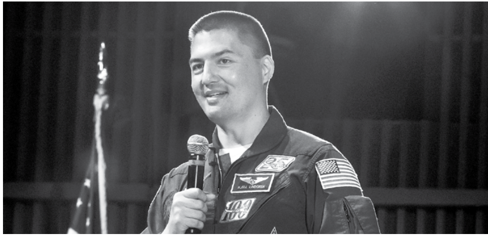
NASA astronaut Dr. Kjell N. Lindgre