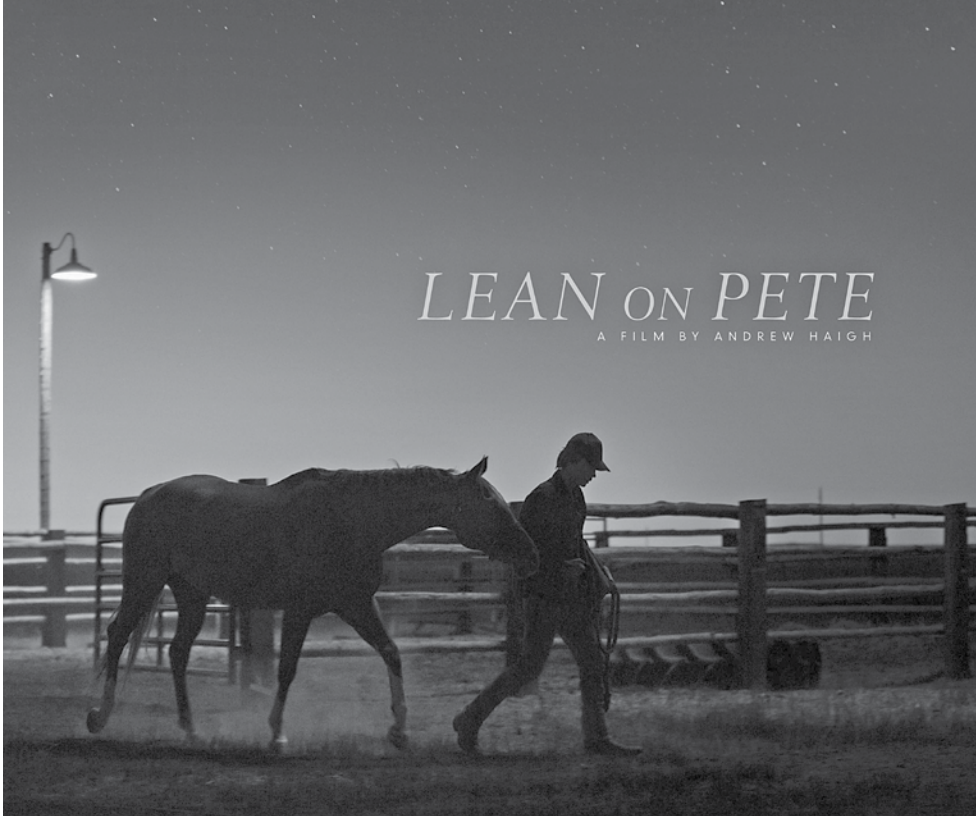
Lean on Pete.

Coming off of last year's role as the kidnapped J. Paul Getty III in All the Money in