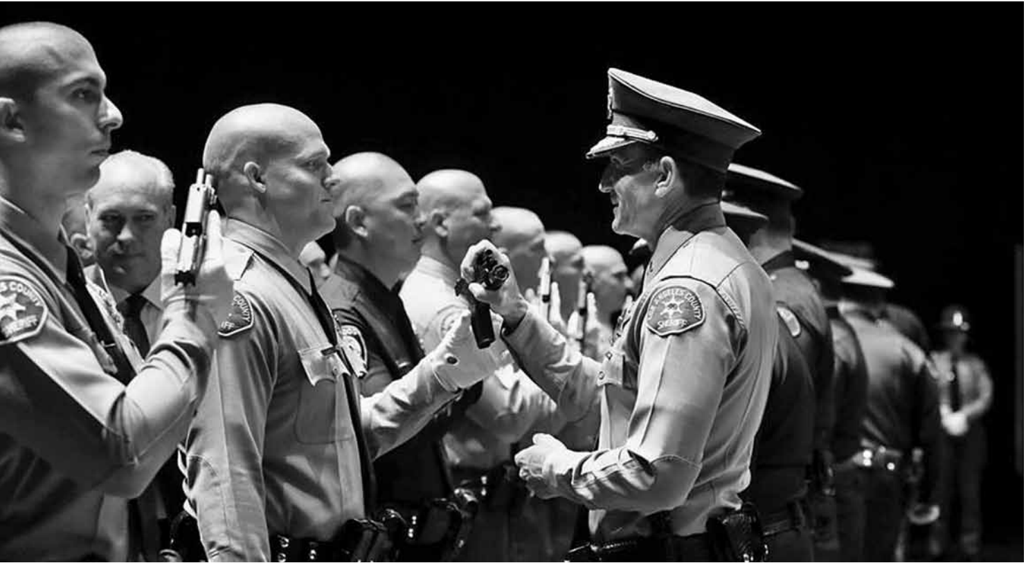
Last Friday, 61 recruits from Academy Class 427 formally took their oaths as sworn peace officers with Sheriff Jim McDonnell presiding over graduation ceremonies at the East Los Angeles College Ingalls Auditorium. Academy Class 427 is made up of seven female and 39 male deputy sheriffs, and two female and 13 male police officers from multiple area police departments – including Inglewood – as well as from the California Department of Insurance.