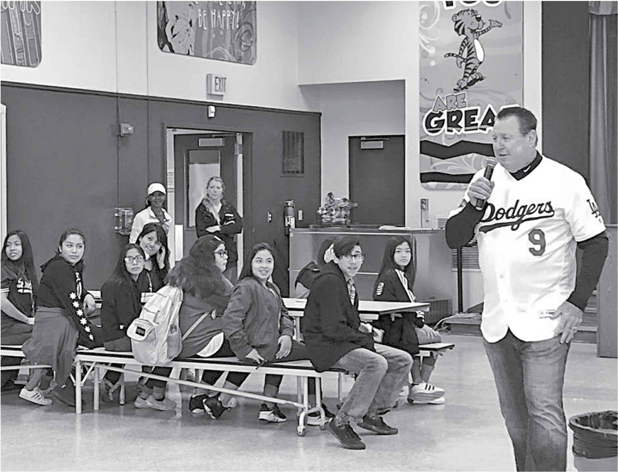
Former Dodger World Series hero Mickey Hatcher visited FDR Elementary on Super Saturday to encourage students on the importance of education, being kind and working hard to achieve your goals.