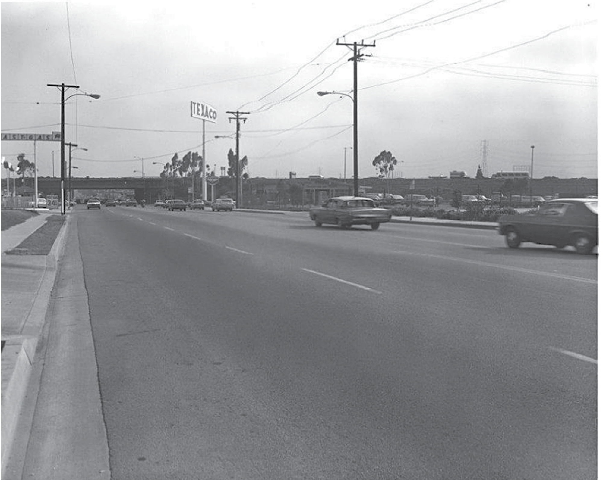
This past Monday, a groundbreaking ceremony took place to kick off long-awaited road improvements on Inglewood Avenue starting at 147th Street. The photo above is a look back a few decades.