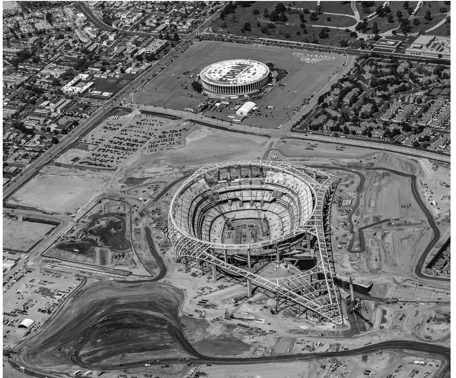
On Monday, Inglewood commemorated the completion of the outer shell of the canopy that will sit atop the LA Stadium bowl. Here is an aerial view of the venue that will be the future home of the Los Angeles Chargers and Los Angeles Rams.