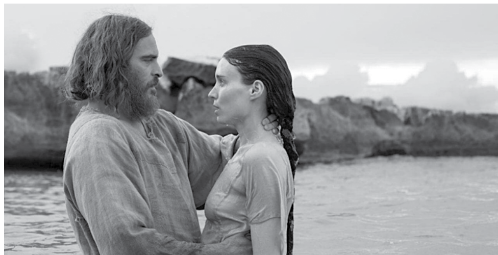
Mary Magdalene

Throughout the film, Davis is respectful to the religion and the beliefs of Christians, handling the crucifixion and miracles with sensitivity. He even goes so far as to dispel the popular "rumor" that Mary Magdalene was a prostitute. In one of the title cards at the end of the film, a statement reads this was a "misconception" started by Pope Gregory in 591 AD.