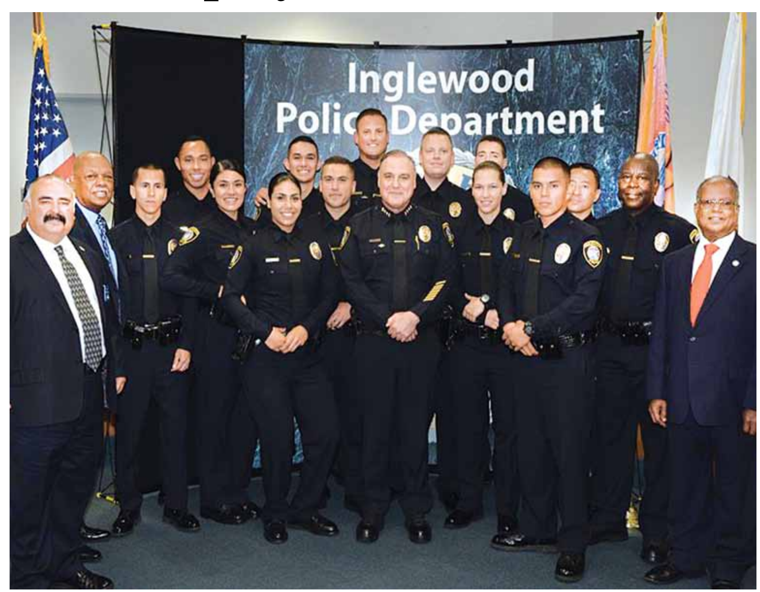
On April 10, the Inglewood Police Department held a badge-pinning ceremony to welcome six new civilian employees and 11 new officers to its family. The department also extended congratulations to two officers recently promoted to detective, and an officer promoted to sergeant.