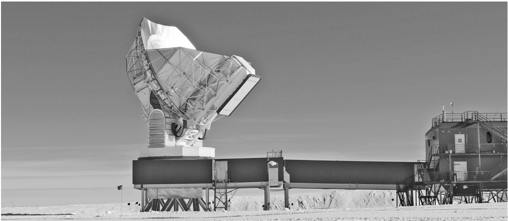
The 10-meter South Pole Telescope, at the National Science Foundation's Amundsen-Scott South Pole Station, joined the global Event Horizon Telescope array in January.

The EHT is an array of radio telescopes connected using a technique known as very long baseline interferometry, or VLBI. Larger telescopes can make sharper observations, and interferometry allows multiple telescopes to act like a single telescope as large as the separation—or “baseline”—between them. “Now that we’ve done VLBI with the