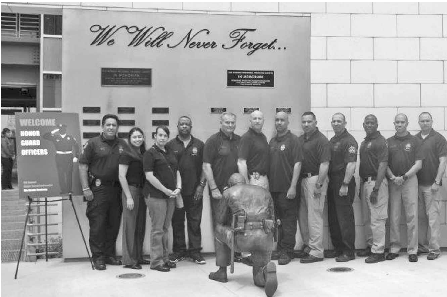
LAX and airport police attended the first annual Area Honor Guard Conference at the Rio Hondo Police Academy, in an effort to train, equip, and provide information on honor guard resources and support. Shown here, the Los Angeles Airport Police Honor Guard at a memorial wall.