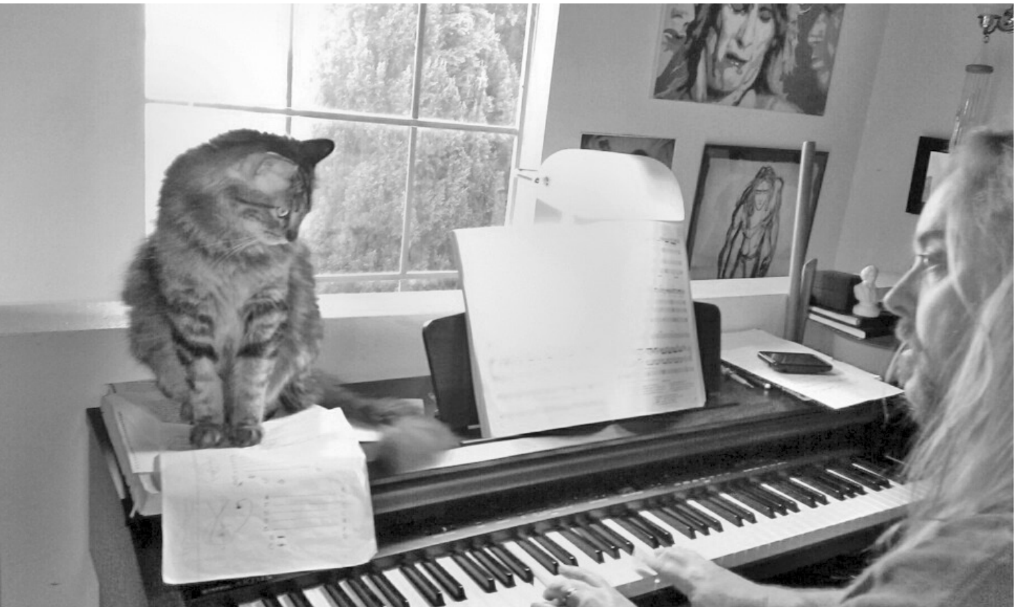
Landau has found the perfect new family to help him adjust.

Landau was initially a little too rough with his new family, not quite sure what this new transition would bring. But with every passing day and his family's patience, he is settling into his true self, letting go of his built-up anxiety from being shuffled around and having to be around so many different cats. His family loves him and are so incredible in working with him! When Landau got excited, he would sometimes stalk and attack them. But they found just blowing in his face or throwing a toy to distract him, it immediately dissipated his energy, settling him right down into a normal kitty. Each day, Landau continues to unwind more and more. His family truly loves him to pieces. Congratulations, Landau on your purr-fect match! •