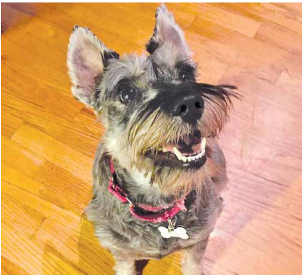
Suzy-Q is now the ruler of the roost in her new Cypress home.

Congratulations and much happiness to our gal Suzy-Q and her new family. Suzy is the little five-year old girl who had bladder stones that was rescued in January. Her Mom always had larger dogs but now she lives in a