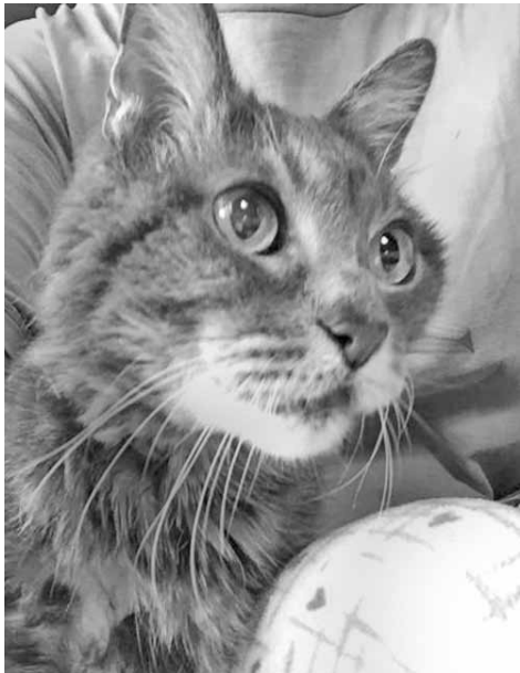
A black and white photograph of a tabby cat lying down, looking towards the camera with its whiskers extended. The cat's fur has a distinct striped pattern, and its eyes are wide and focused. The background is dark and out of focus.

Why the name Black Pearl ? As you can see she is beautifully black, but she has a few