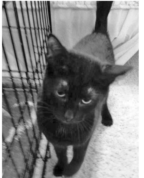
Black Pearl is adorably soft and well-behaved.

noon to 3:30 p.m. in Westchester at 8655 Lincoln Blvd. just south of Manchester Ave. and also in Mar Vista at 3860 Centinela Ave, just south of Venice Boulevard. Our website lists additional adoption sites and directions to each location.