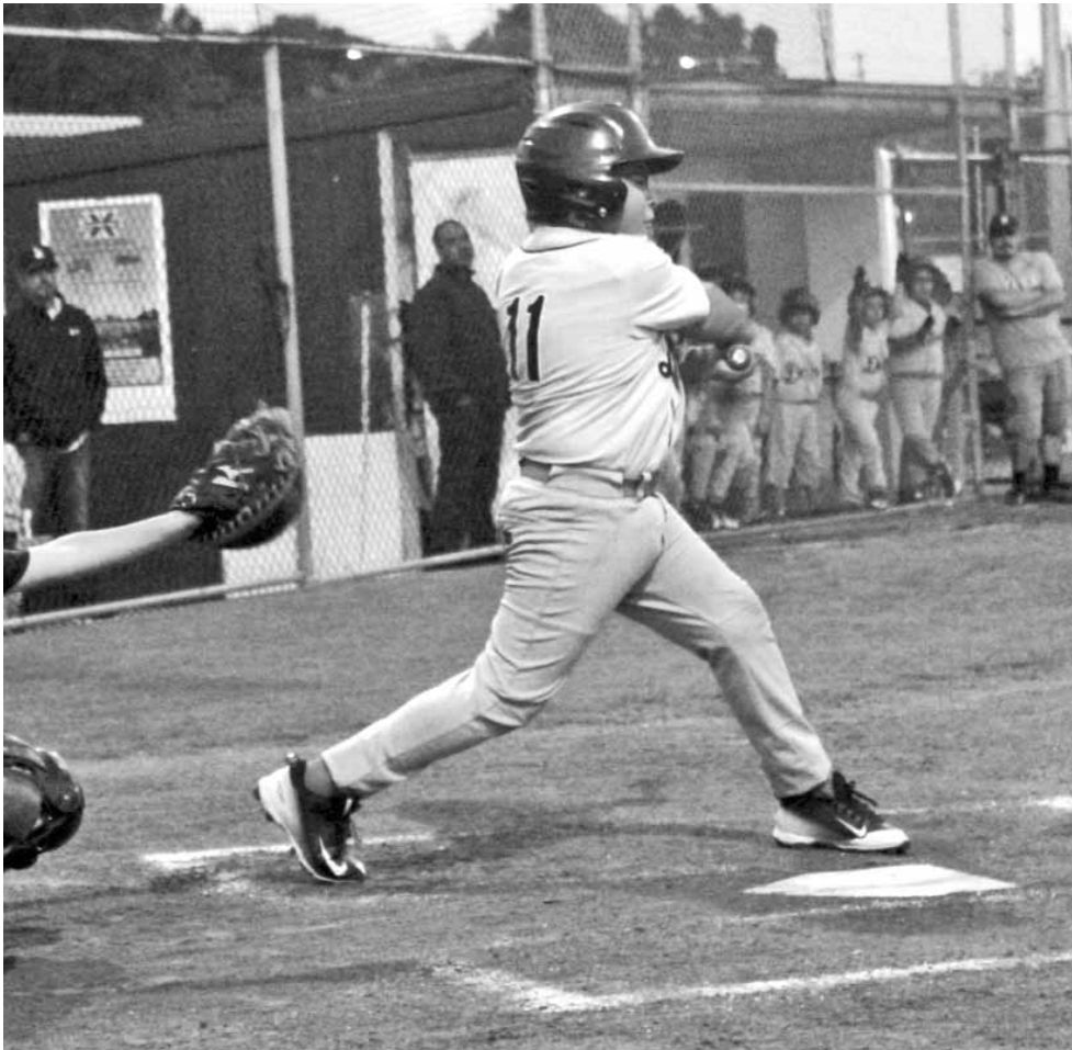
A Lennox Tiger batter takes a swing at a pitch during a Carl Magee District 37 Tournament of Champions game against the Westchester Yankees on Friday.