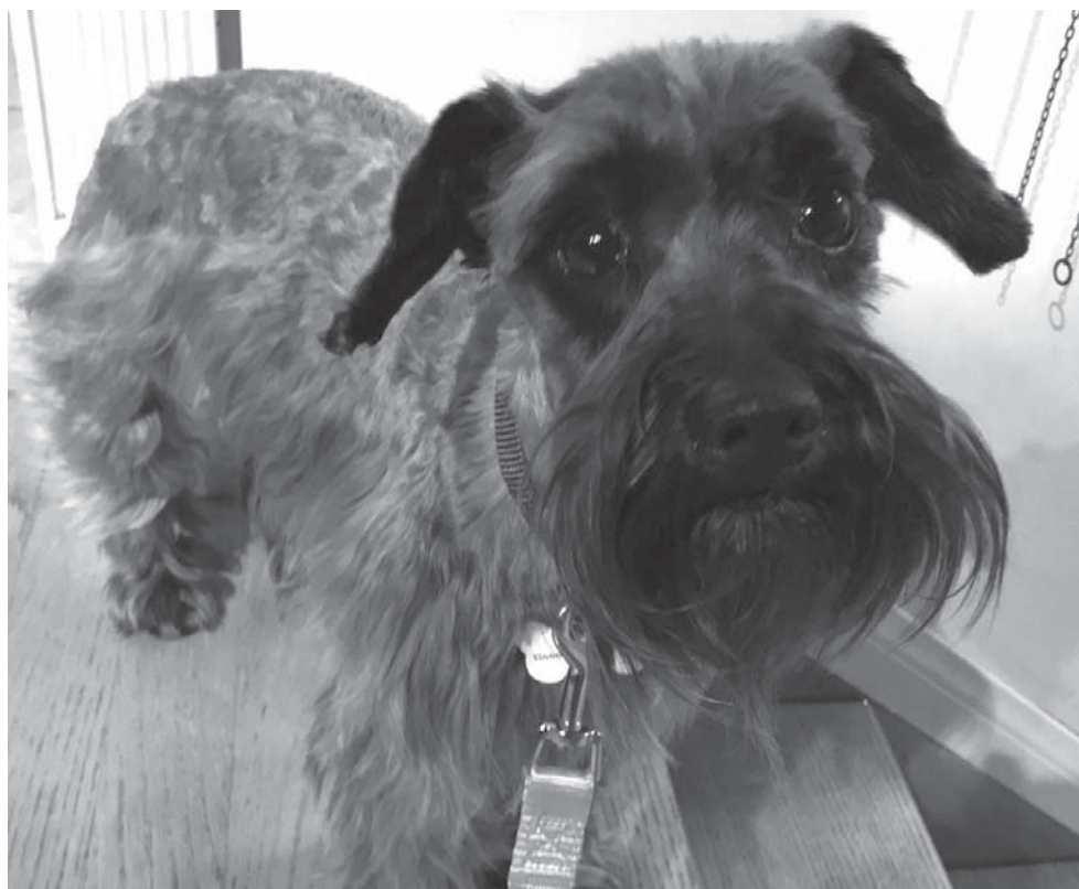
Congratulations to Chloe and her new family!

Congratulations to Chloe and her new family. It was no surprise to anyone that she found her forever home so quickly! This little gal, who was dumped by her previous owners because she didn't want to be left alone in the yard all day and kept escaping, is a real sweetie. Chloe's folks are previous adopters who have MSFR 2013 alumnus Lulu, formerly known as Trish. Chloe's mom brought Lulu to a meet and greet and it was love at first sight. Although her new dad couldn't make the meet and greet, she worked her magic and apparently he's also quite smitten with this tiny girl. In fact, even Lulu is thrilled and the ladies are getting along famously. We wish the Lake Forest family much happiness and lots of wonderful times together. •