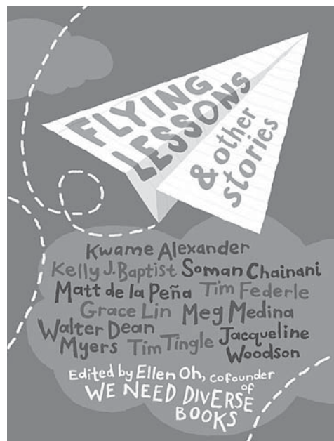
Flying Lessons & Other Stories edited by Ellen Oh.

Summer looms and all of the kids are collectively throwing their arms into the air with wild abandon accompanied by whoops of delirious jubilation. A well-earned break from sums, essays, and earmarked arithmetic