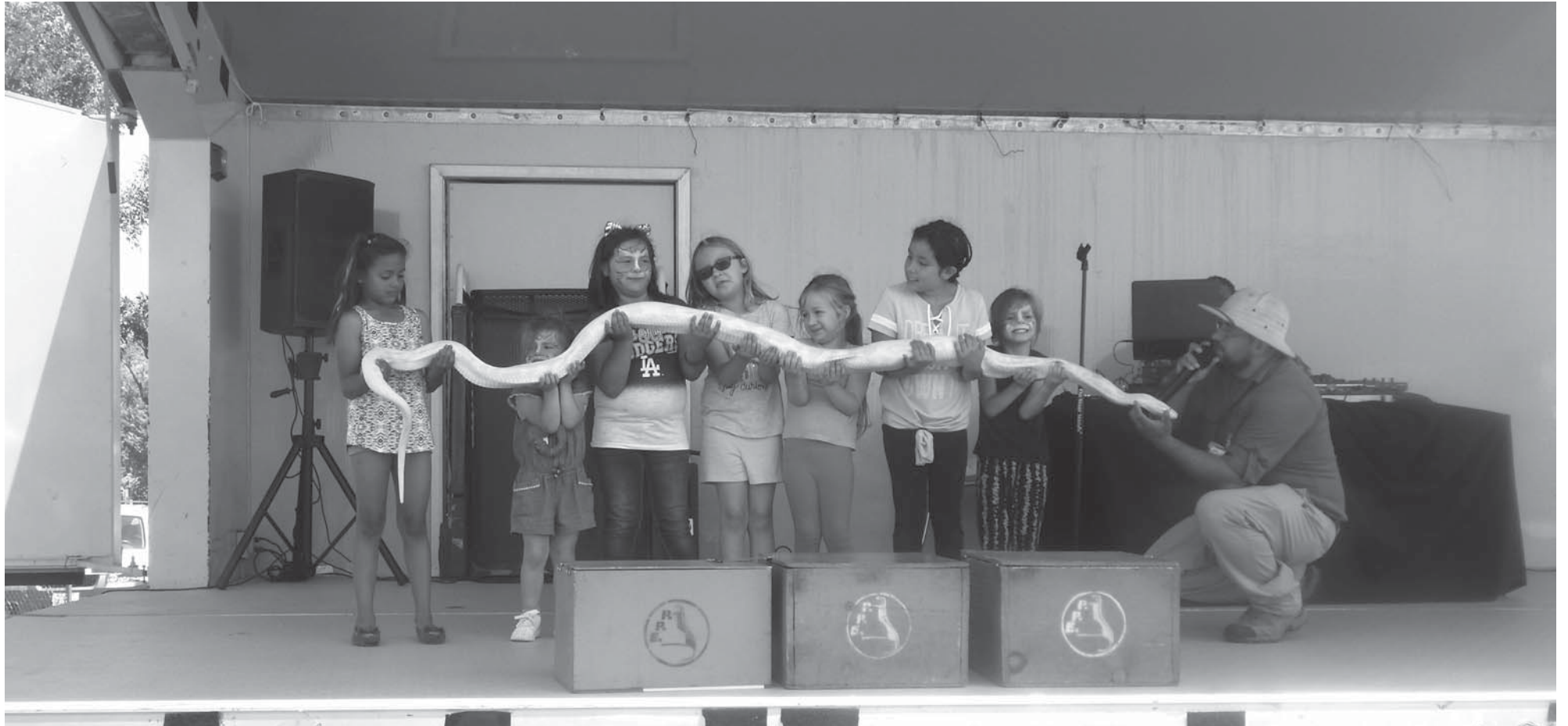
Caption: Brave, adventure-seeking children displaying a 10-foot-long python for the crowd at the City of Lawndale's annual Health Safety and Pet Fair at Jane Addams Park on June 9.