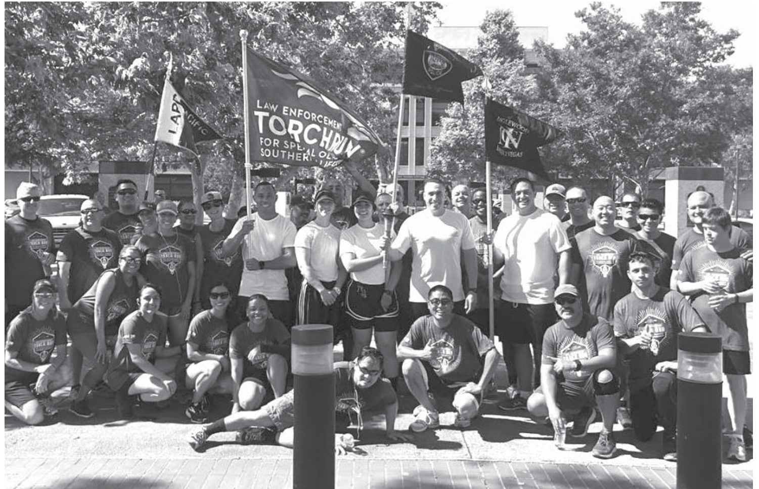
Last week, Inglewood Police officers had the privilege and honor of carrying the Special Olympic Torch through the community. Officers received the torch from LAPD Pacific Division and handed it off to CHP West LA. •