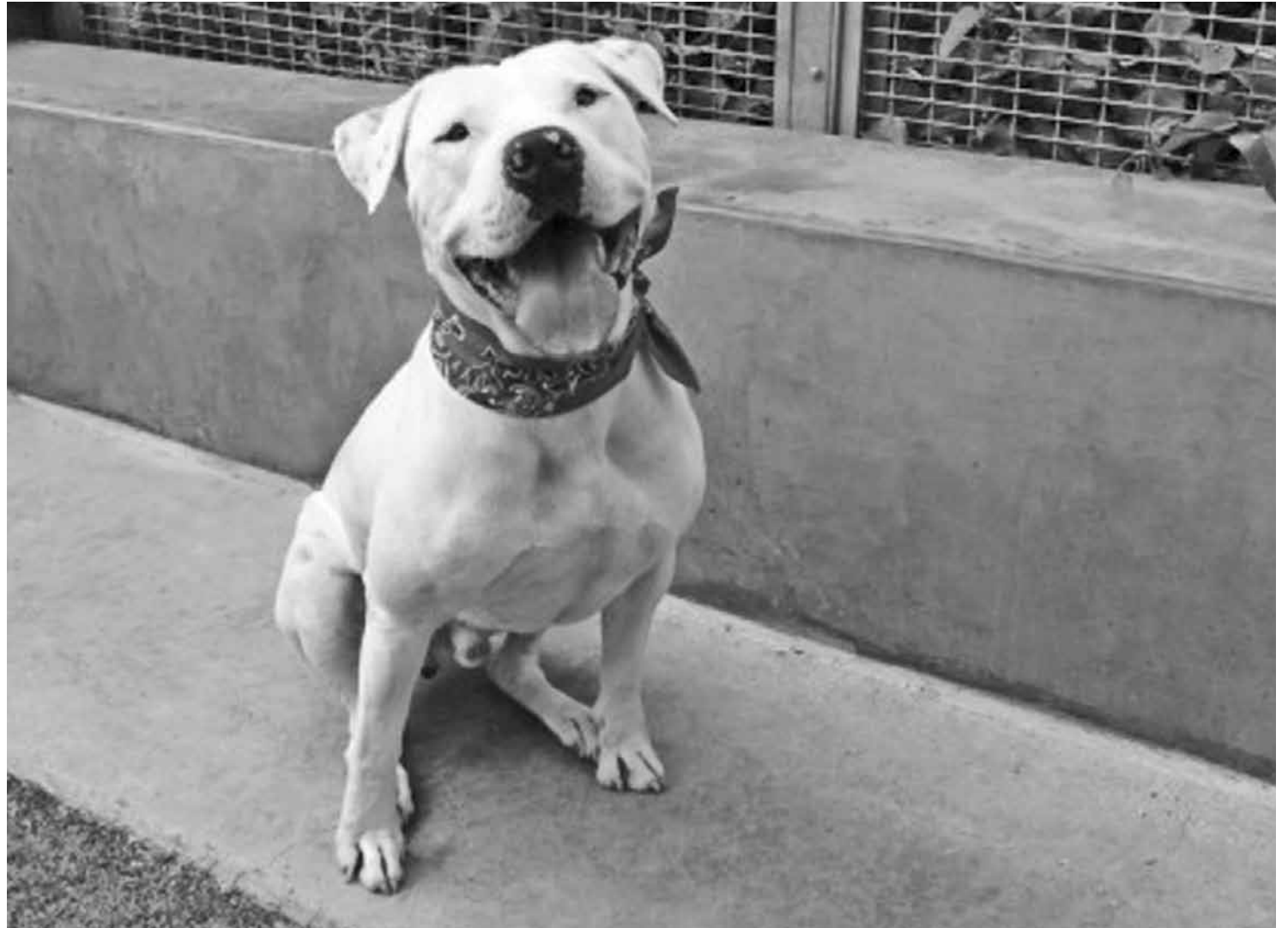
Berto (A1504778) is a 1 year old, white & freckled, neutered male, pit bull masterpiece!! Great on the leash, attentive, affectionate, curious about the world and eager to please! Berto loves people and will make a wonderful family addition!! Please consider adopting Berto! He needs a home. You can see a video of Berto at https://www.youtube.com/watch?v=r8zCni8m6P8. Contact Harbor Shelter, San Pedro, at 310.548.2632.