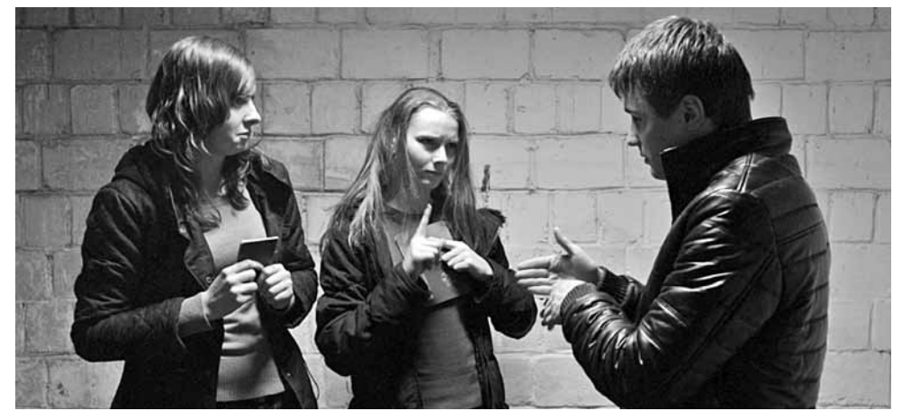
The Tribe.

I can't think of the last movie I went to that left me physically uneasy, and I say that as a compliment. I felt cold sitting in the theatre, and I attribute that to the phenomenal