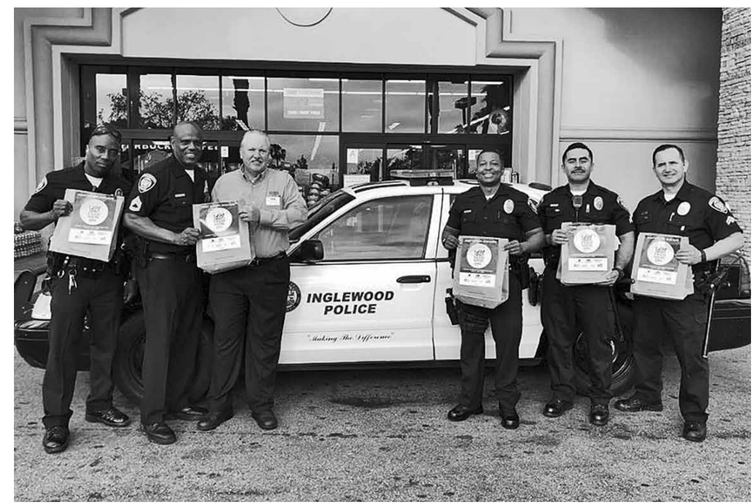
Inglewood Police Department officers did their part in donating to the @abc7 7th Annual Feed SoCal Food Drive to help end hunger. The June campaign supported Los Angeles Regional Food Bank, among others in the region.