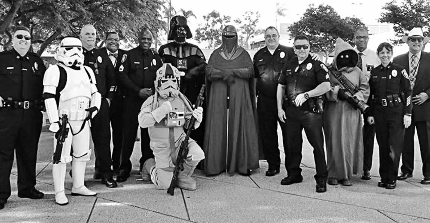
The Inglewood Police Department recently hosted National Night Out behind City Hall. The festivities included food, music and family fun as parents and children had the opportunity to interact with the officers who keep local streets safe. And a few recognizable characters also made an appearance...