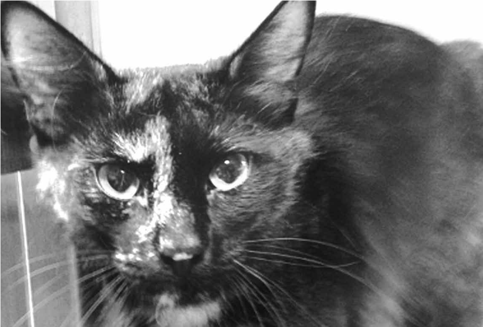
Beanie acts sassy but is sweet and loves to cuddle.

Looking for your purr-fect match? Kitties of all colors and sizes are ready for the forever home with you.