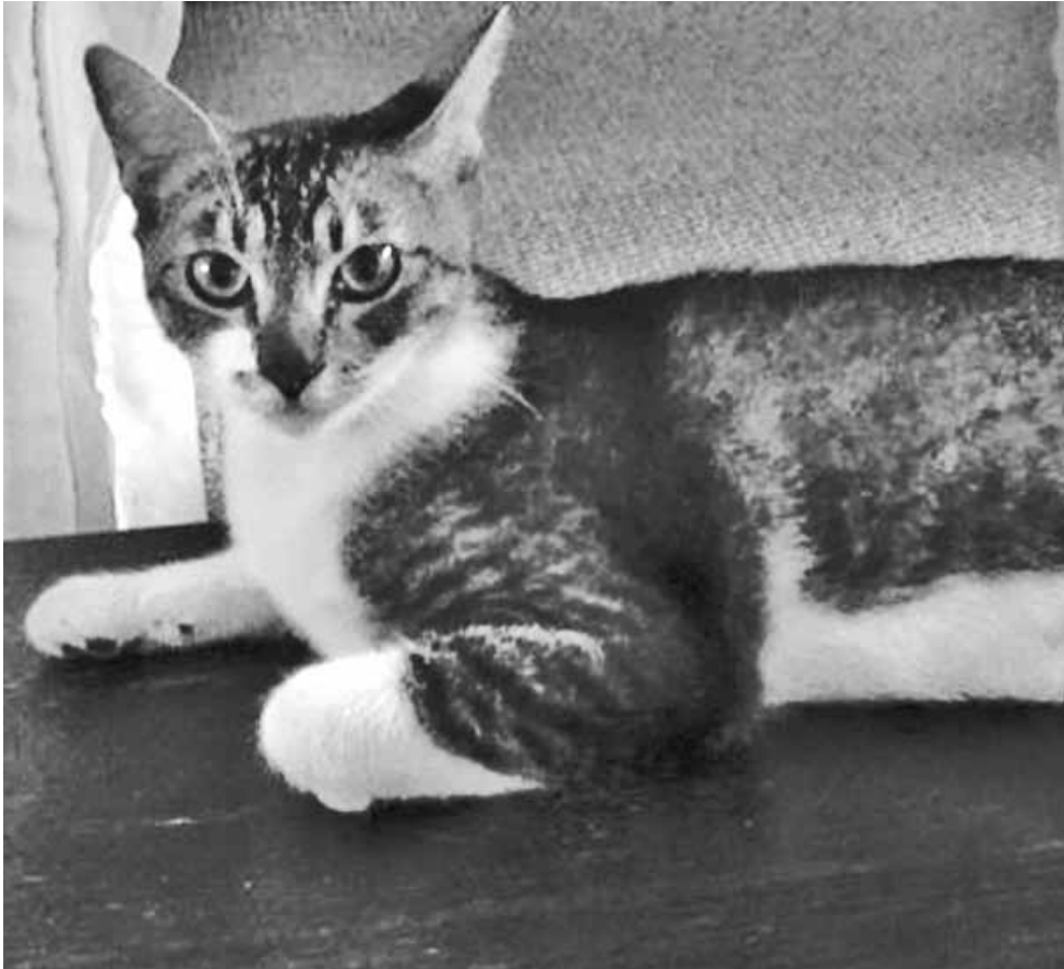
Coco is an Abyssinian mix, and is smart and inquisitive.

white mark on his nose. He still loves to play like a kitten and is an explorer cat who loves to climb. One of his favorite things to do is keep lookout from the top of a cat tree. Finn would love to keep you company and follow you around, staying on top of all the action! He is looking for his forever home with his sister and best friend Karma. They've been a bit confused after their owners gave them up for adoption. But if you give them a little time and a lot of love, Finn and Karma will settle right in! Because they grew up together,