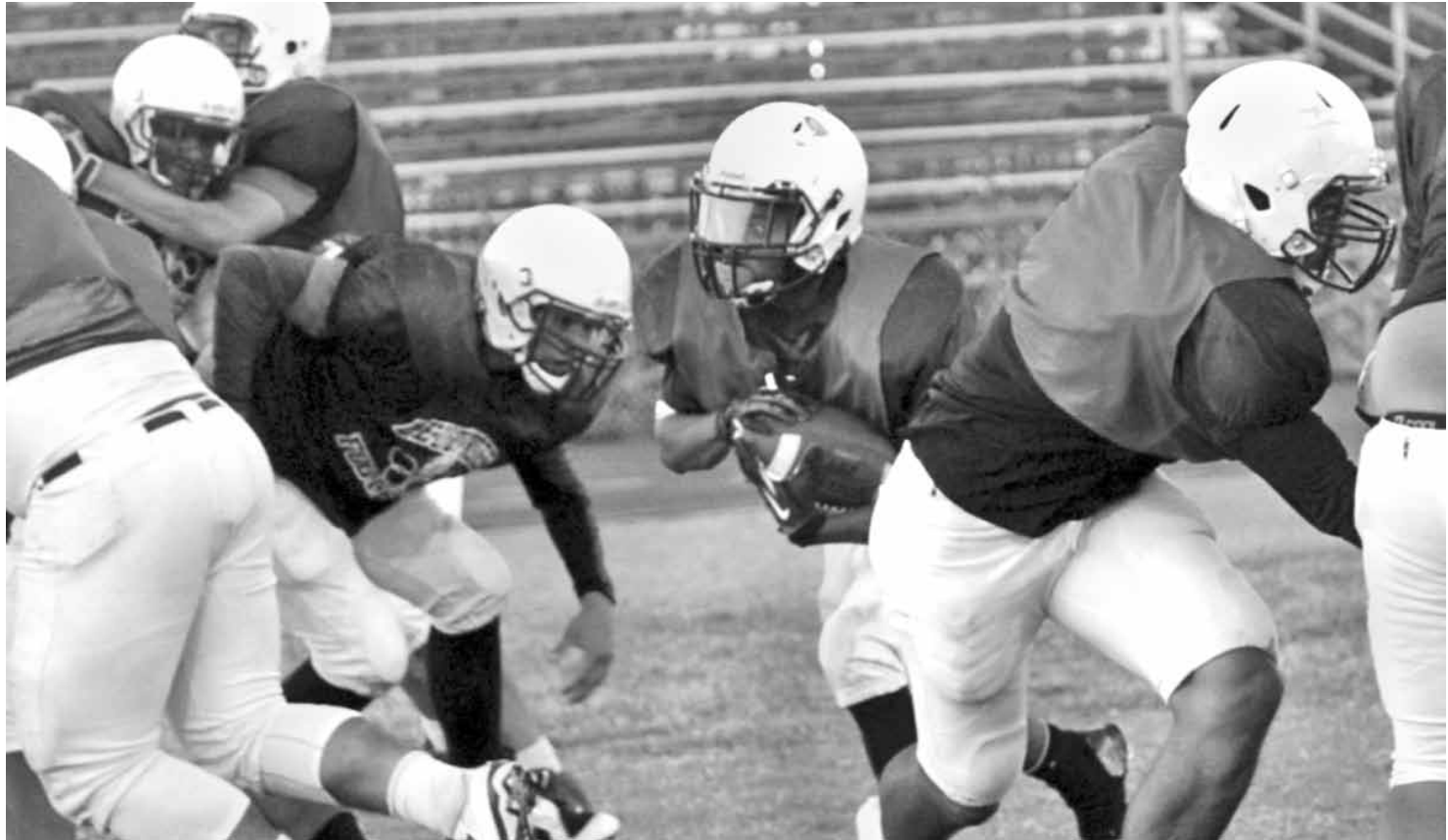
A Leuzinger High ballcarrier attempts to get past tacklers during a recent intersquad scrimmage. The Olympians begin their season against Morningside Friday at Coleman Stadium