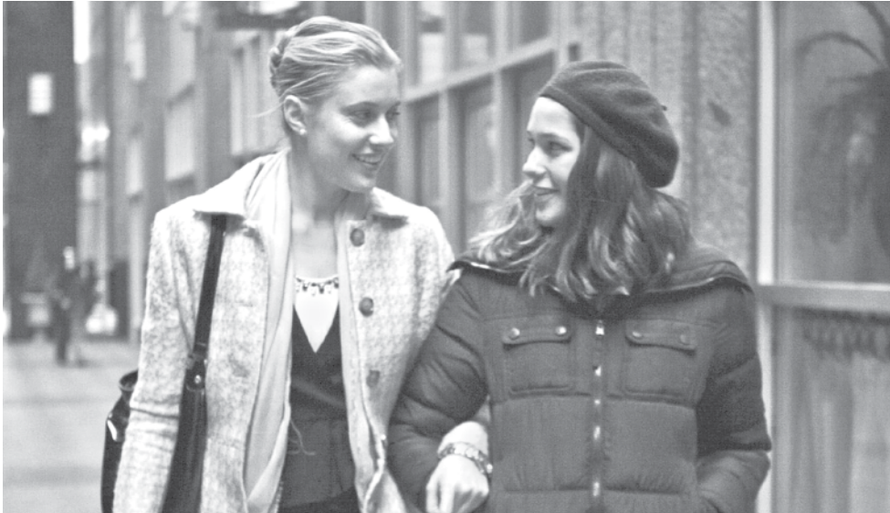
Greta Gerwig as "Brooke" and Lola Kirke as "Tracy" in Mistress America.

her fiancé's own out-of-school-age daughter who lives nearby. Enter Brooke (Gerwig), who immediately and literally embraces her new step-sister and opens Tracy's eyes to a world of spontaneous adventures. What makes Mistress America so fun (and it really is) is its intelligentsia-tinged hilariousness that here, channels screwball-styled comedy, showing how finely Baumbach and Gerwig have their fingers on this culture's hipster-pulsed