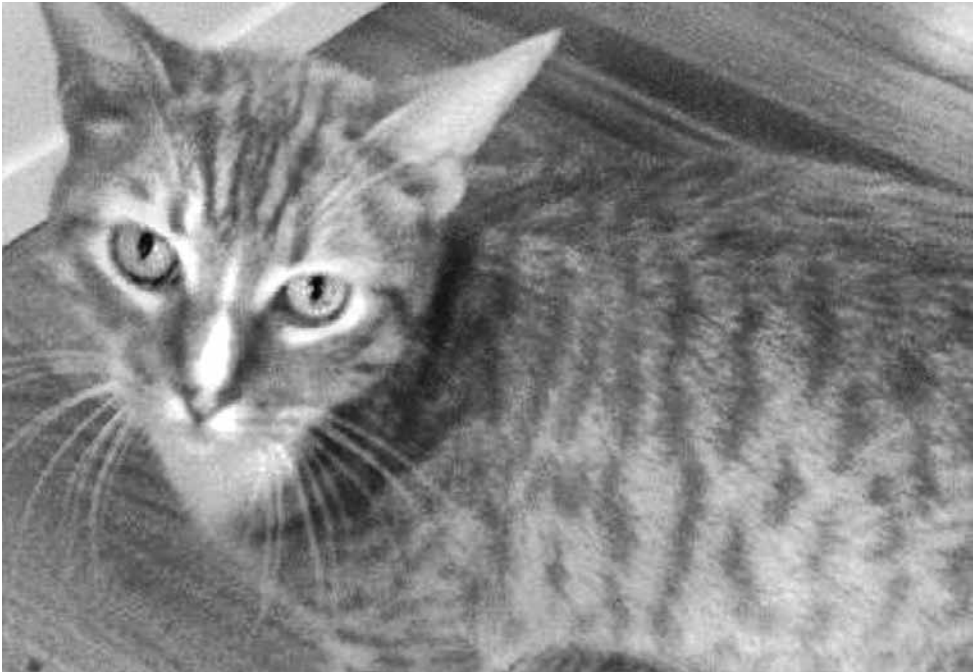
Finn is an explorer.

Be kind. Save a life. Support animal rescue.