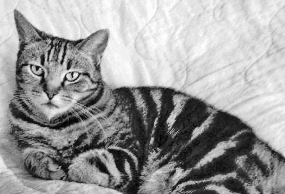
Karma is sweet and loves to be petted.

they can be nervous around other kitties, so Finn and Karma need a home where they can be the only cats.