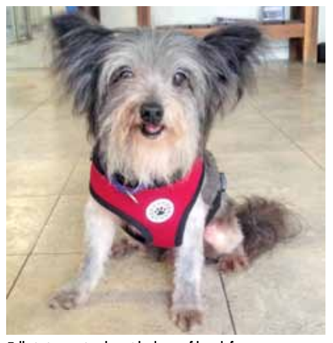
Tolkein is a senior dog with plenty of love left.

haven't written a book, I do have a philosophy on life. Older pets, especially little old men like me, make great companions! I am a 10-year old, male, Yorkie mix who was rescued from a county shelter last year. I was malnourished, filthy and terrified when I was introduced to the people at Yellow Brick Road. Over time, I have grown to love and trust people as well as enjoy the company of other dogs. I'm 10 pounds of affection and pretty quiet - not at all yappy - for a little guy. Although I don't require much exercise, I'm always ready to go for a walk. The YBR folks think I am adorable and would make a great companion for a calm home with or without other pets. Tolkien can be seen anytime at Yellow Brick Road Doggie Playcare in El Segundo Call 310-606-5507.