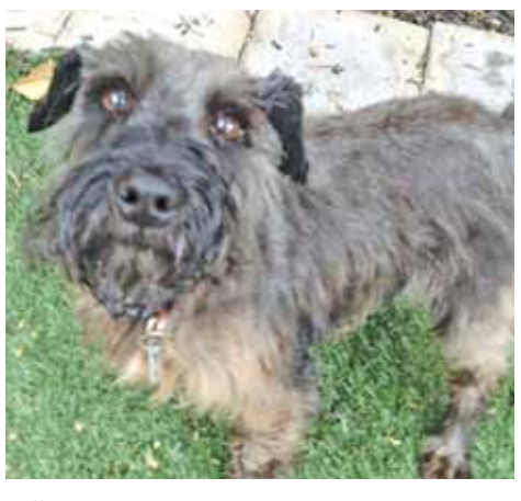
Waffles is a mellow guy who gets along with everyone.

haven't written a book, I do have a philosophy on life. Older pets, especially little old men like me, make great companions! I am a 10-year old, male, Yorkie mix who was rescued from a county shelter last year. I was malnourished, filthy and terrified when I was introduced to the people at Yellow Brick Road. Over time, I have grown to love and trust people as well as enjoy the company of other dogs. I'm 10 pounds of affection and pretty quiet - not at all yappy - for a little guy. Although I don't require much exercise, I'm always ready to go for a walk. The YBR folks think I am adorable and would make a great companion for a calm home with or without other pets. Tolkien can be seen anytime at Yellow Brick Road Doggie Playcare in El Segundo Call 310-606-5507.