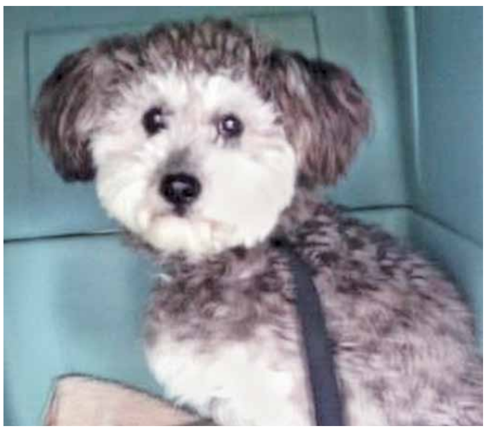
Arabelle is a shy and quiet girl who needs a new home.

We are looking for volunteers to help with our Saturday pet adoption events which are held at the Petco located at 537 N. Pacific Coast Highway Redondo Beach 90277. If you are interested in volunteering and can commit to at least one Saturday a month, please contact us at info@msfr.org