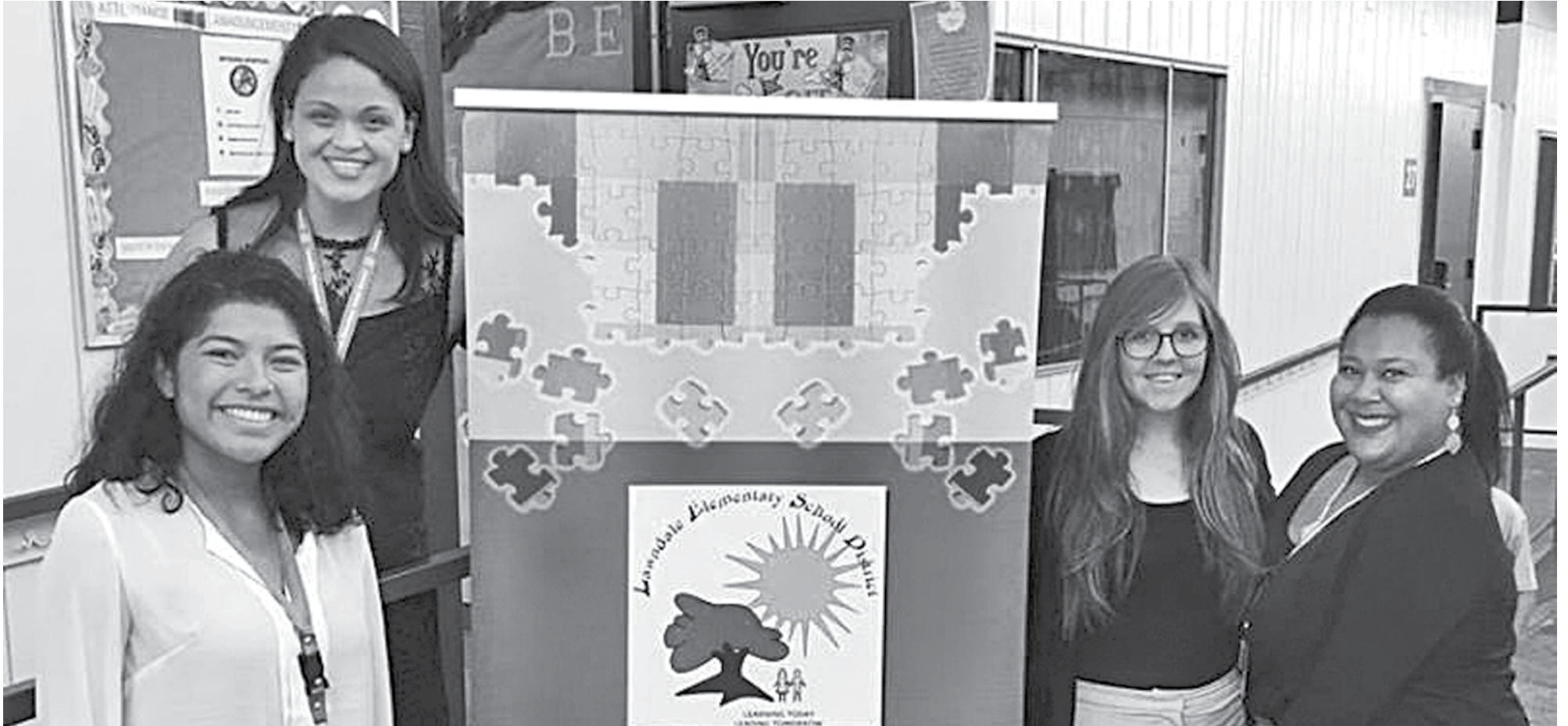
Among those in the house at Back to School Night at Billy Mitchell Elementary School were these awesome Student Support Services Interns.