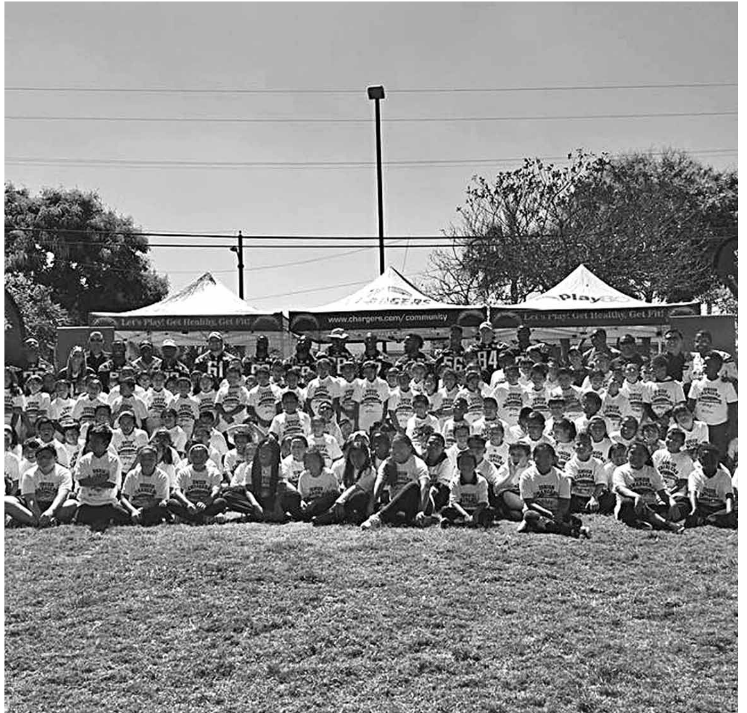
The Los Angeles Chargers hosted a Play60 camp with members of the Inglewood Police Department at Worthington Elementary School last week.