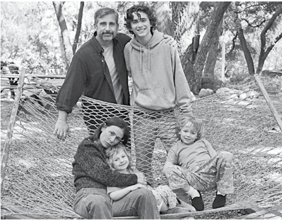
Beautiful Boy