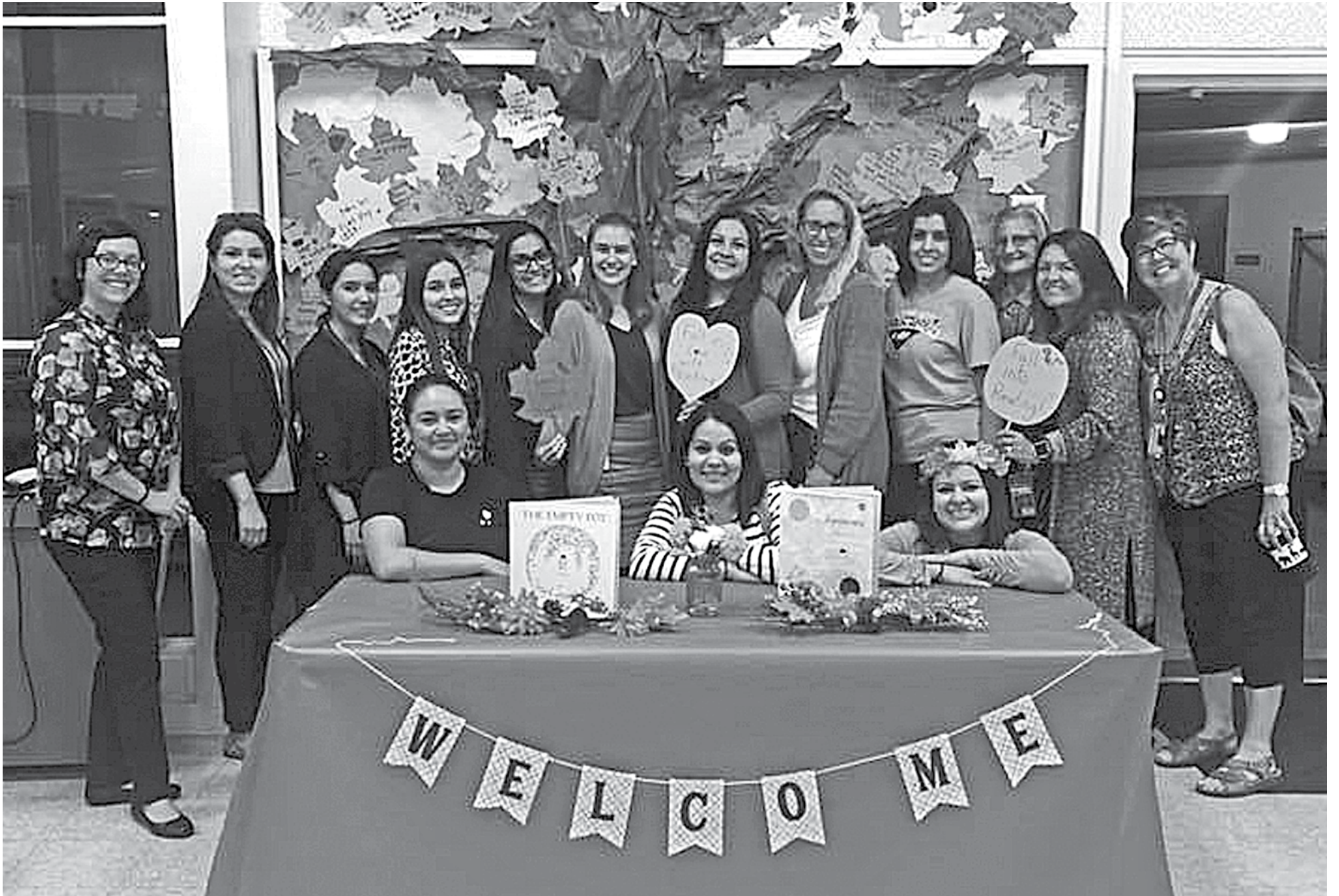
Family Literacy Night was a huge success over at Mark Twain Elementary School last week.