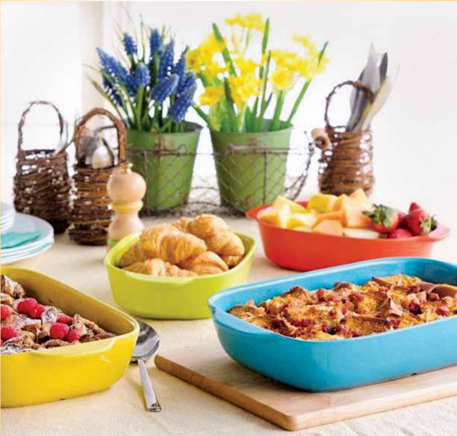
Serves 4 or 16 tasting portions