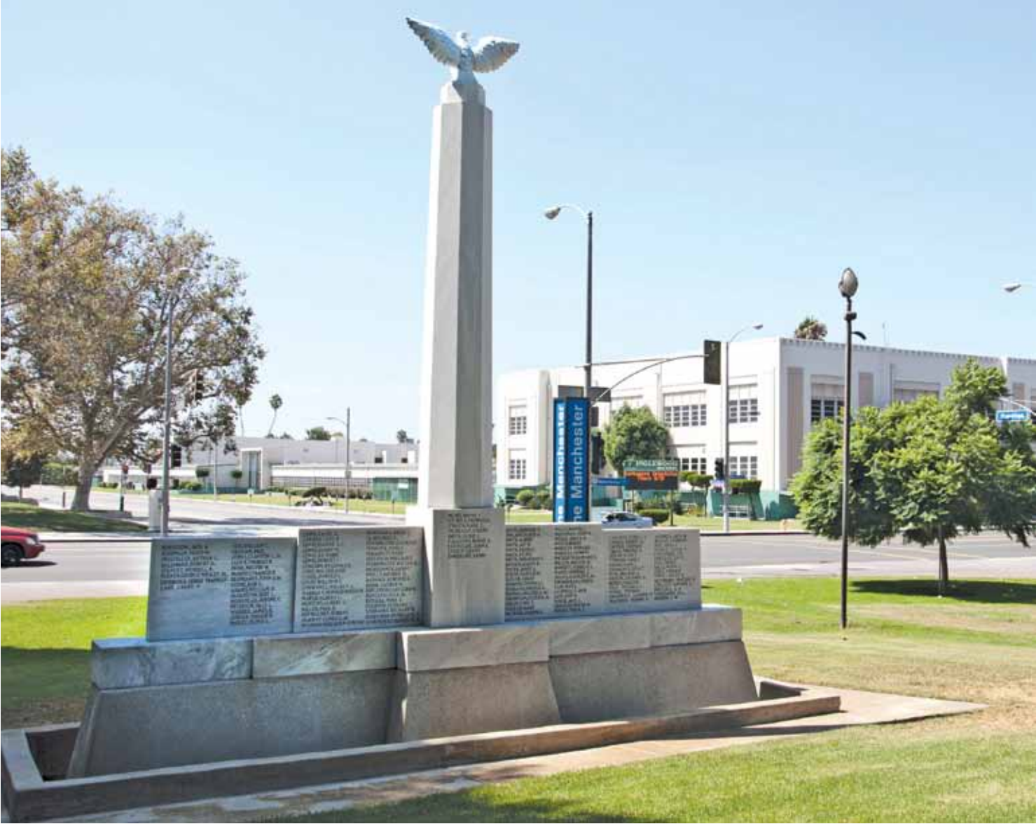
View of the Veteran's Memorial outside of Inglewood City Hall. The memorial is dedicated to the veterans who gave their lives in the Korean War, Vietnam, and World War II. The inscription says, "To Keep Forever Living the Freedom For Which They Died."