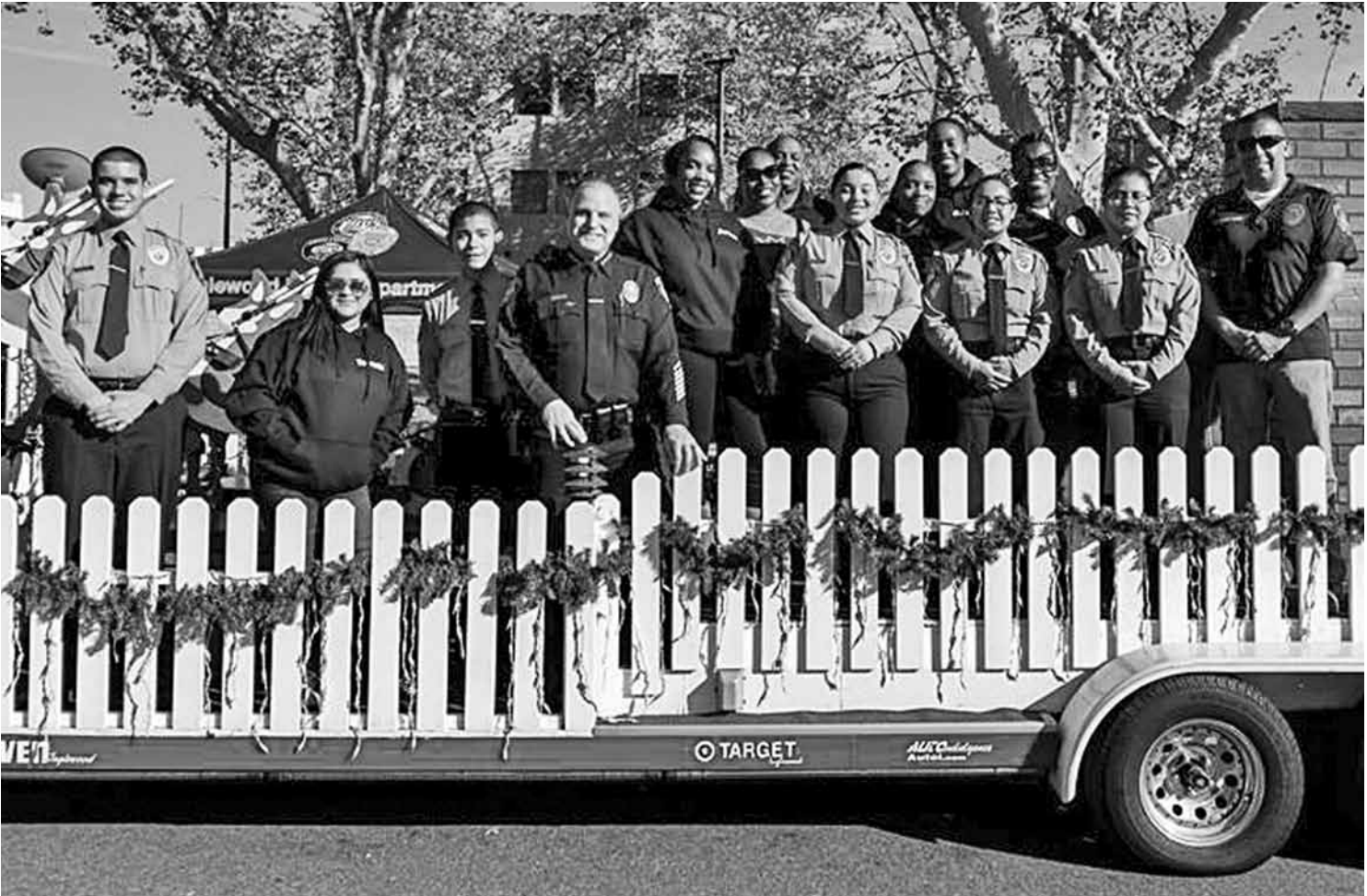
The Inglewood Police Department hosted another successful Stuff the Trailer toy drive to help out local families during the holiday season.