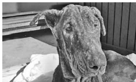
Please take a special look at little Louie. This is the ugly, heartbreaking side of pet

This is the truly, heart-breaking side of pet rescue. Louie is a seven-month-old purebred red Doberman Pinscher who was purchased from a breeder, had his ears cropped and then was chained in the backyard at 3 months of age when he came down with mange. This poor pup has been suffering from demodex mange for the last four months. His prior owner was not committed to the medical treatment and brought him to her local vet to be euthanized. She was talked into owner surrendering Louie by one of the veterinarian technicians and he was brought to us. The