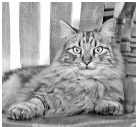
To help more loving kitties get “Home for the Holidays,” Kitten Rescue is offering 50% off adoption fees in December for all cats two years and older.

When you adopt a “pet without a partner”, you will forever make a difference in their life and they are sure to make a difference in yours.