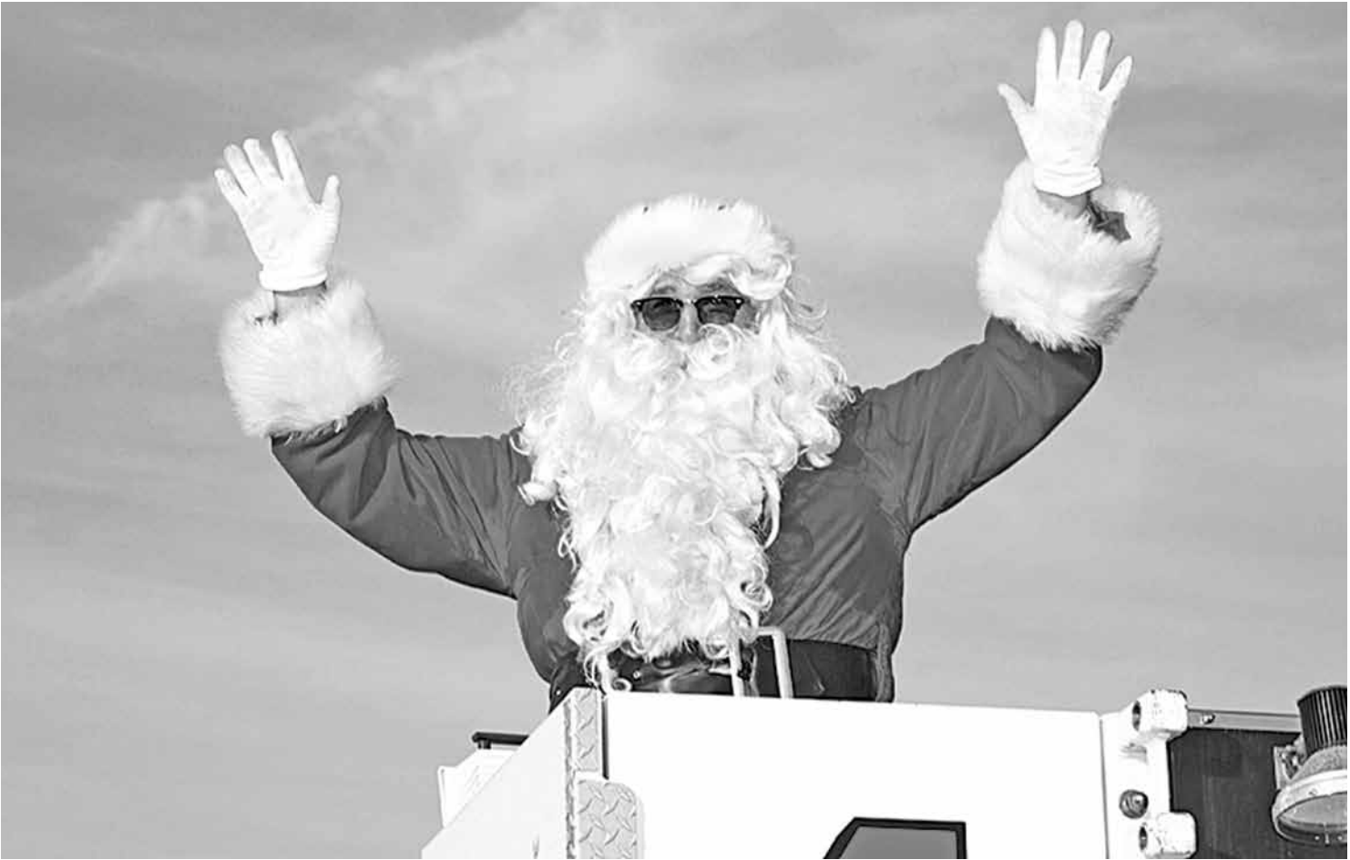
South Bay Santa wishes everyone in Hawthorne, Inglewood, and Lawndale a Merry Christmas!