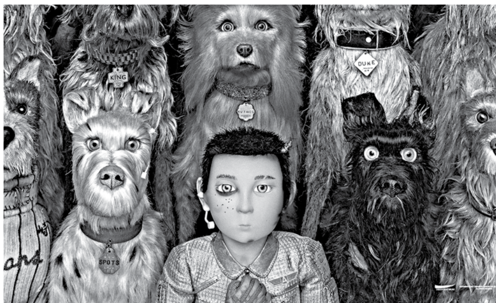
Isle of Dogs.

tight, which makes sense since this isn't Anderson's first foray into stop-motion animation. His 2009 outing, Fantastic Mr. Fox , saw the auteur first explore the stop-motion medium by bringing the seminal children's book to the big screen. While it was acclaimed for all of the right reasons, it also felt like a director doing a one-off homage to beloved source material