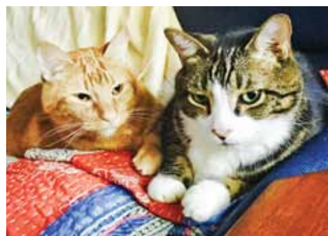
Tomato and Dexter.

Dexter is a very social guy. When he's excited, his stubby little tail jiggles. And Dex has the biggest, most beautiful green eyes.