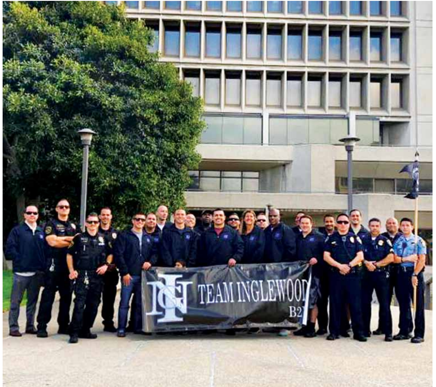
Team Inglewood, comprised of members of the local police department shown in the photo, brought home a Challenge Cup Relay mug for finishing fifth in the 500 invitational category in the 2018 Baker 2 Vegas run.