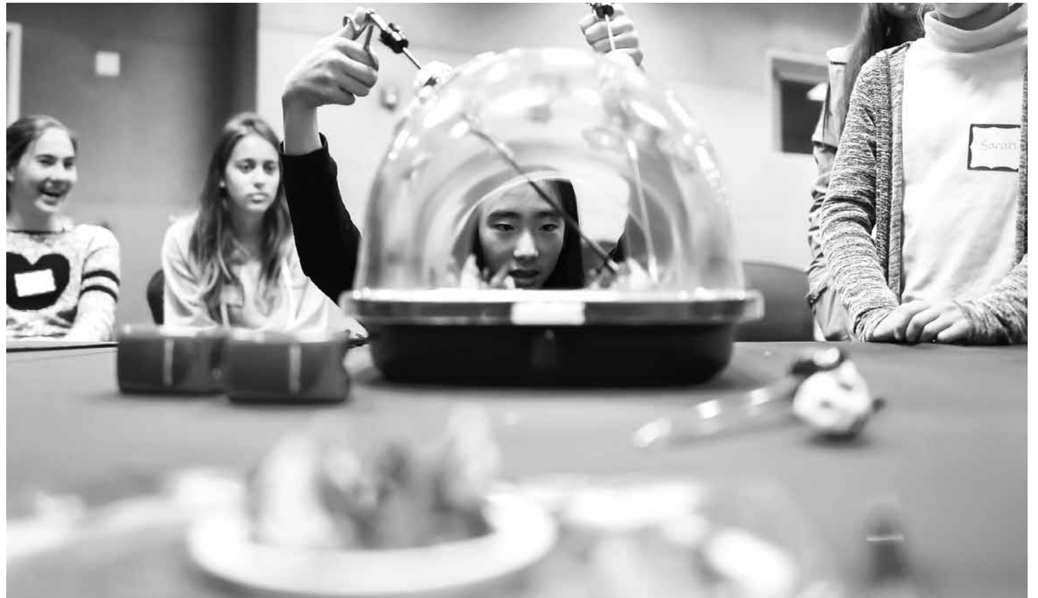
Palos Verdes Intermediate School STEM (science, technology, engineering and technology) students learned about laparoscopic and robotic surgery while participating in simulation exercises during a recent field trip to Torrance Memorial Medical Center. Laparoscopic surgery technique pictured above.