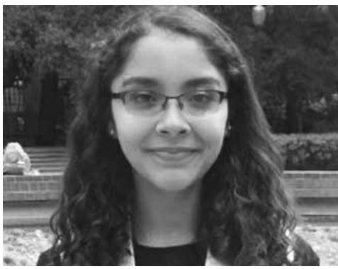
A high school senior from Inglewood who attends Da Vinci Science School in Hawthorne