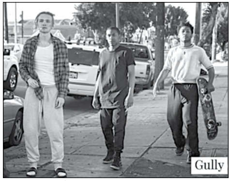
Gully