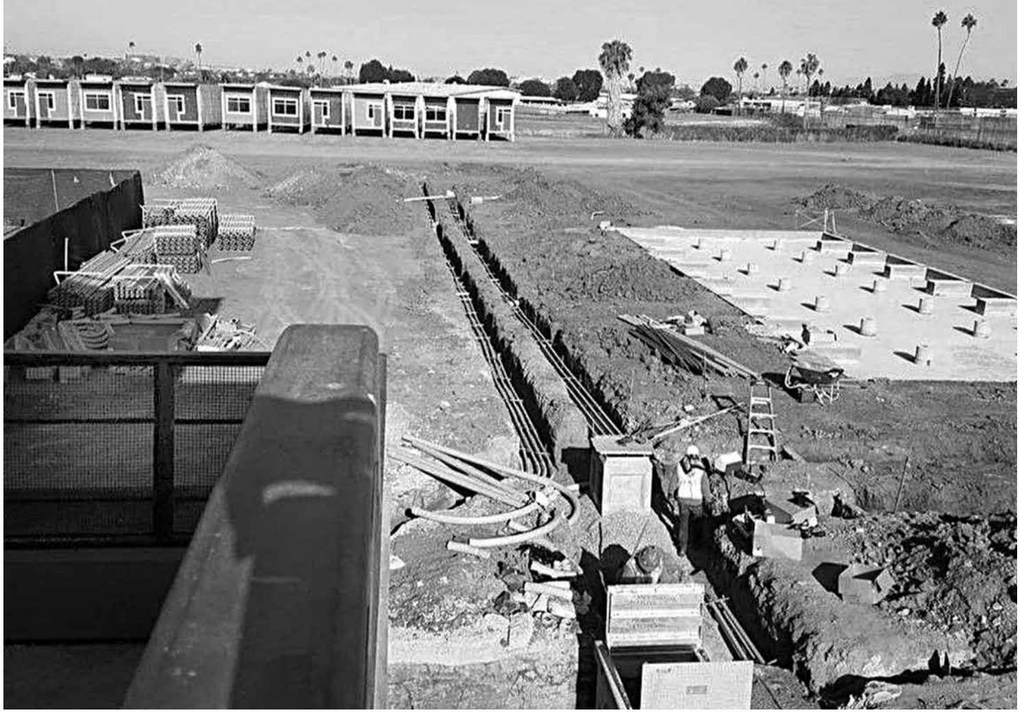
Last week, eight of the 16 new modular classrooms arrived at the Woodworth-Monroe TK-8 campus. Let the improvements begin!