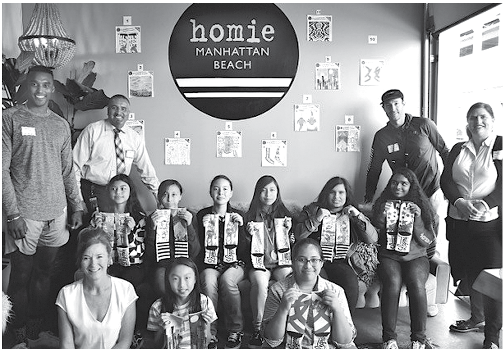
Congratulations to students from Jane Addams Middle School and Will Rogers Middle School for being finalists in last week's "Socks that Rock" contest! Eight Lawndale Elementary School District students were honored with a sock in their design at the Homie Café in Manhattan Beach.