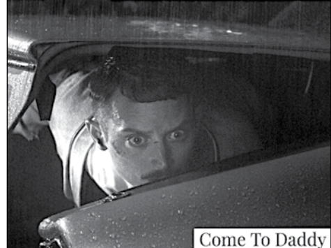
Come to Daddy

The funniest and wildest movie we saw at