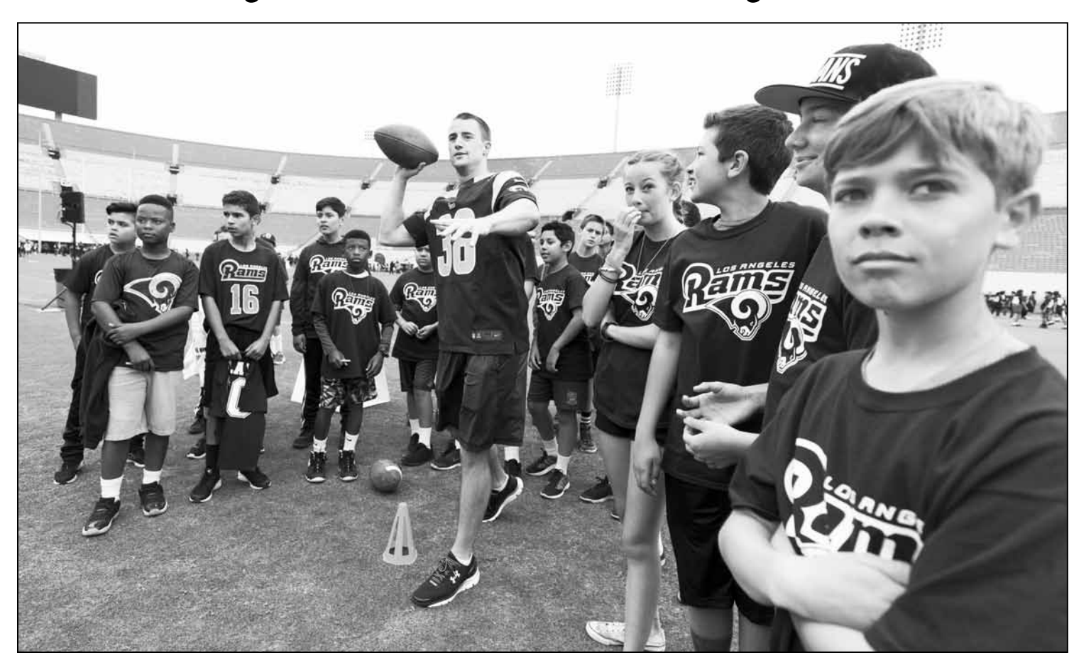
Earlier this month, more than 900 elementary and middle school students gathered at the LA Memorial Colisuem to enjoy a day of active play with the Los Angeles Rams and the American Heart Association to celebrate the completion of the first NFL Play 60 Challenge in LA. The third to eighth graders participated in football toss, jump rope, touchdown catch/run, 40-yard dash, ladder drill with several Rams players in attendance.