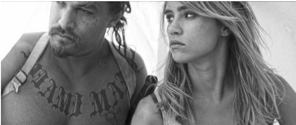
Jason Momoa and Suki Waterhouse in The Bad Batch . Courtesy of NEON