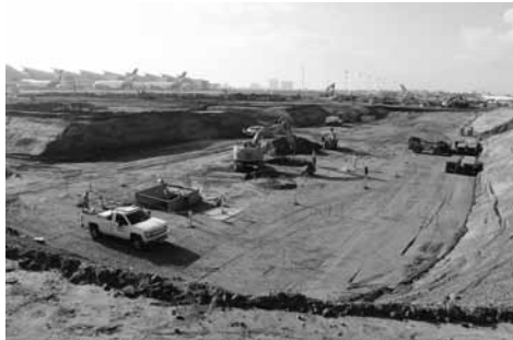
The LAX modernization project started in 2009 and the work is expected to last through 2023, creating more than 120,000 construction jobs per year.

Contractors kept employees on the job longer because firms couldn't find enough skilled and qualified people for their projects, according to the building trade association's economist. But, more projects such as the newly announced Inglewood arena for the Clippers would make the labor shortage even