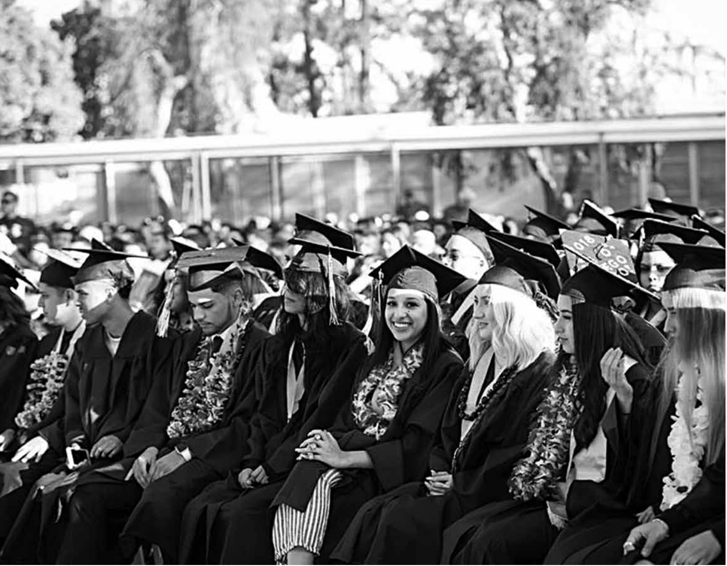
Ánimo Inglewood Charter High School proudly celebrated the end of a successful school year as students walked the stage at the graduation ceremony. School leadership, educators and staff congratulated the overwhelming success of the graduates and proudly welcomed them into the ranks of Green Dot alumni. •