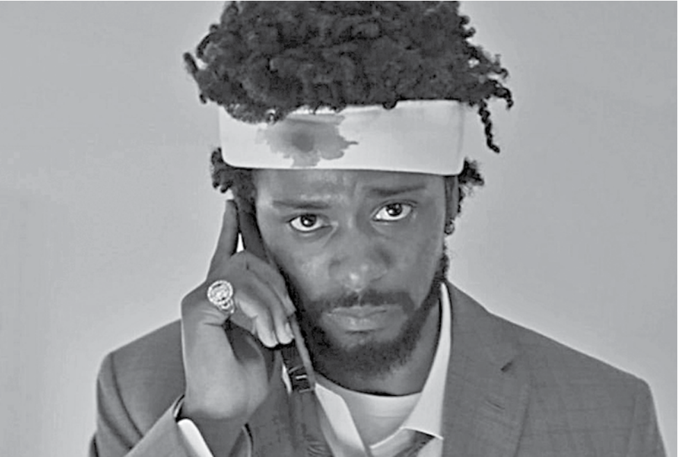
Sorry to Bother You