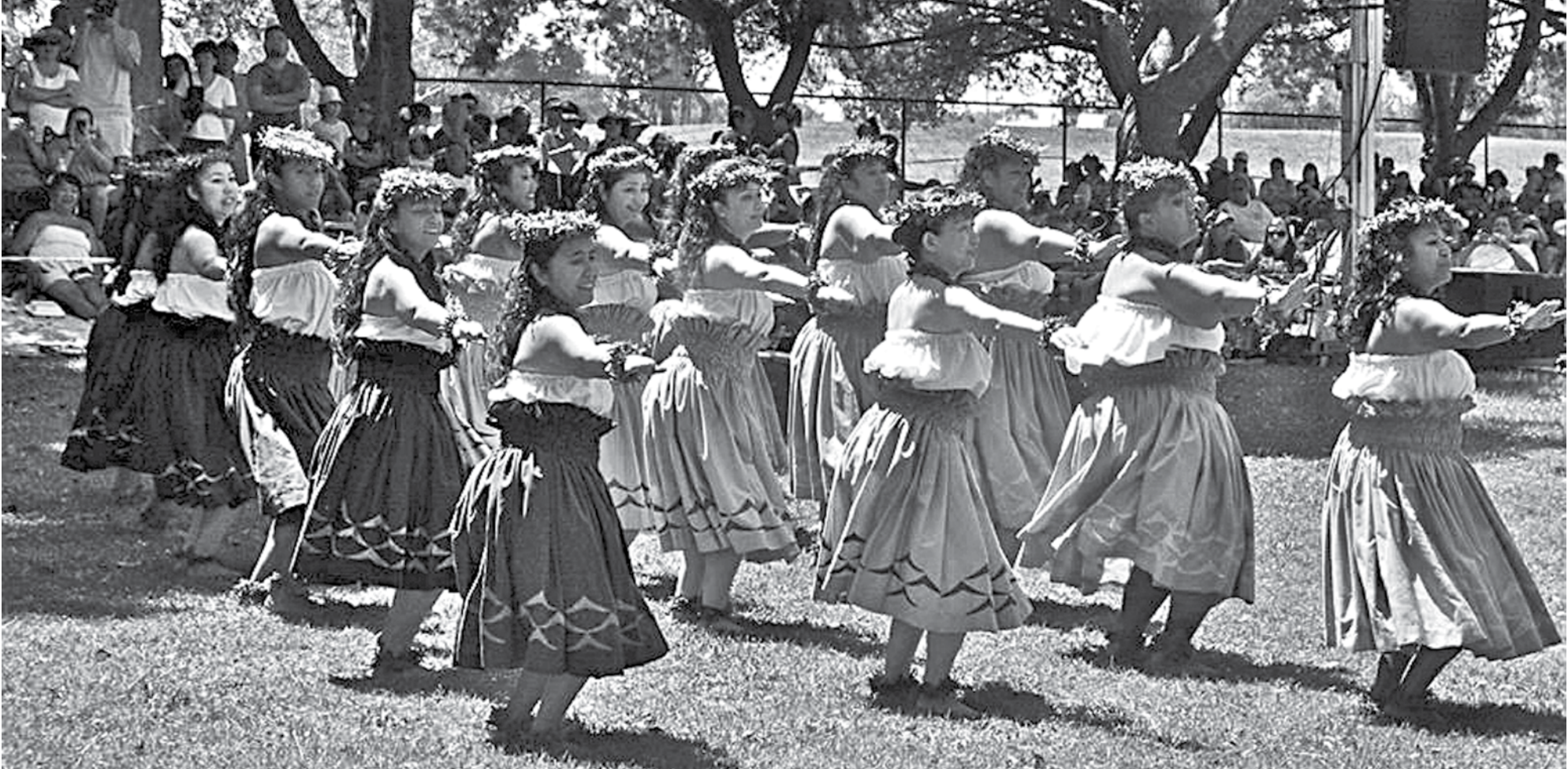
The Hawaiian Inter Club Council of Southern California 40th Anniversary Ho’olaule’a is scheduled for July 21 and July 22 at Alondra Park in Lawndale. It’s free admission with great entertainment, plenty of shopping and local-style food. The festivities run both days from 9 to 5. For updates and a list of performers, go to www.hiccsc.org .