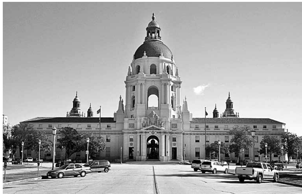
Pasadena City Hall.

COSPAR is celebrating its 60th anniversary this year. It was founded in 1958—the same year the U.S. launched the Explorer 1 [ https://www.jpl.nasa.gov/missions/explorer-1 ] spacecraft, a research satellite built and operated by JPL. •