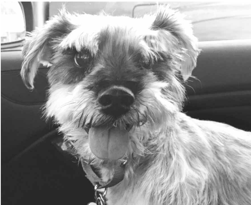
Enjoy you new family Emmy Lou!

Congratulations to little Emmy Lou and her new mom. Emmy Lou is the senior female rescue that came to us weighing a mere 11 pounds and looking pretty scrawny. She has gained 3.5 pounds and currently looks great. Emmy Lou had a dental and a full senior screen that revealed no medical problems. In fact, the only issue was a little incontinence problem, which may require diapers down the road. She now lives in Huntington Beach with her retired mom who has no problem with diapers and dogs if it should come to that. In fact Emmy Lou's mom has had many Schnauzers in the past, including an eight-year-old that she adopted who lived another 10 happy years before going to Rainbow Bridge. When she met Emmy Lou, she was absolutely thrilled with how sweet and adorable she is and there was never a question of her