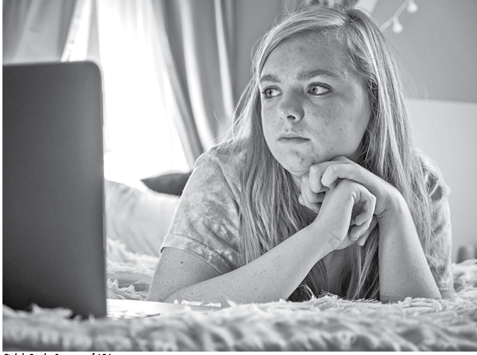
Eighth Grade

artificiality of pop consumerism is such a large part of kids' lives. The content they take in is then recreated and re-stylized in a feedback loop that results in being either so out of touch with reality or hyper in touch with a false one. This is what stirs Kayla, who is introverted and reserved at school but comes to life online making inspirational and self-help videos to an audience of none.