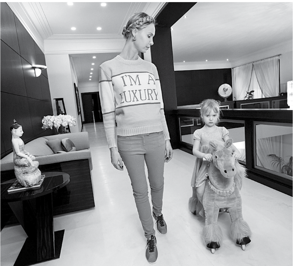
Generation Wealth.