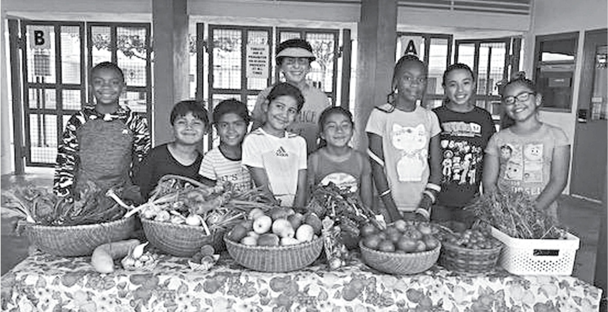
The RAP students at Lawndale’s Billy Mitchell Elementary School recently distributed school garden-grown fruits and vegetables. What a treat!