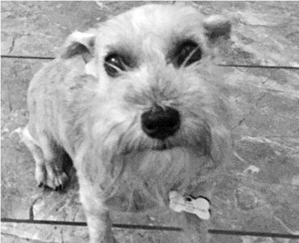
Congratulations to Blanca and her new family!

Congratulations to Blanca and her new mom! After recently losing two of her Schnauzers/Schnauzer mixes due to old age (the second being recently), she was on a mission for a lively companion. After discussions regarding her living arrangement, she decided that a wilder pup was probably not a good match. Then she spotted Blanca -- who is a nice, calm, well-mannered, mature lady -- and decided that she was the gal for her! Since Mom is retired, that's icing on the cake for Blanca, now named Ash, who is happily residing in Seal Beach. Our follow-up report is that Mom couldn't be happier and thinks Ash is absolutely perfect! Wishing them lots of happiness and years of companionship.