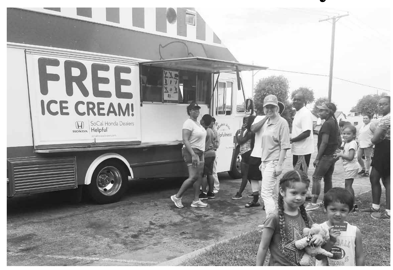
The Helpful Guys in Blue recently treated kids of all ages to some complimentary ice cream at Inglewood's Edward Vincent, Jr. Park.