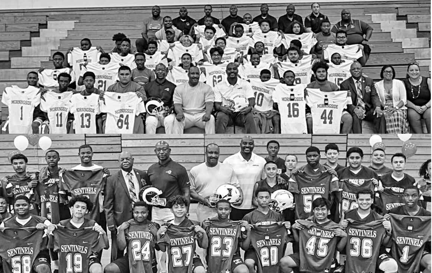
The Los Angeles Rams and Los Angeles Chargers teamed up to surprise Inglewood High and Morningside High with new football uniforms. Presenting the new uniforms was Rams Hall of Fame running back Eric Dickerson. Chargers former defensive end Marcellus Wiley revealed the new uniforms and spoke to each varsity team about unity, character and the importance of teamwork in their community.