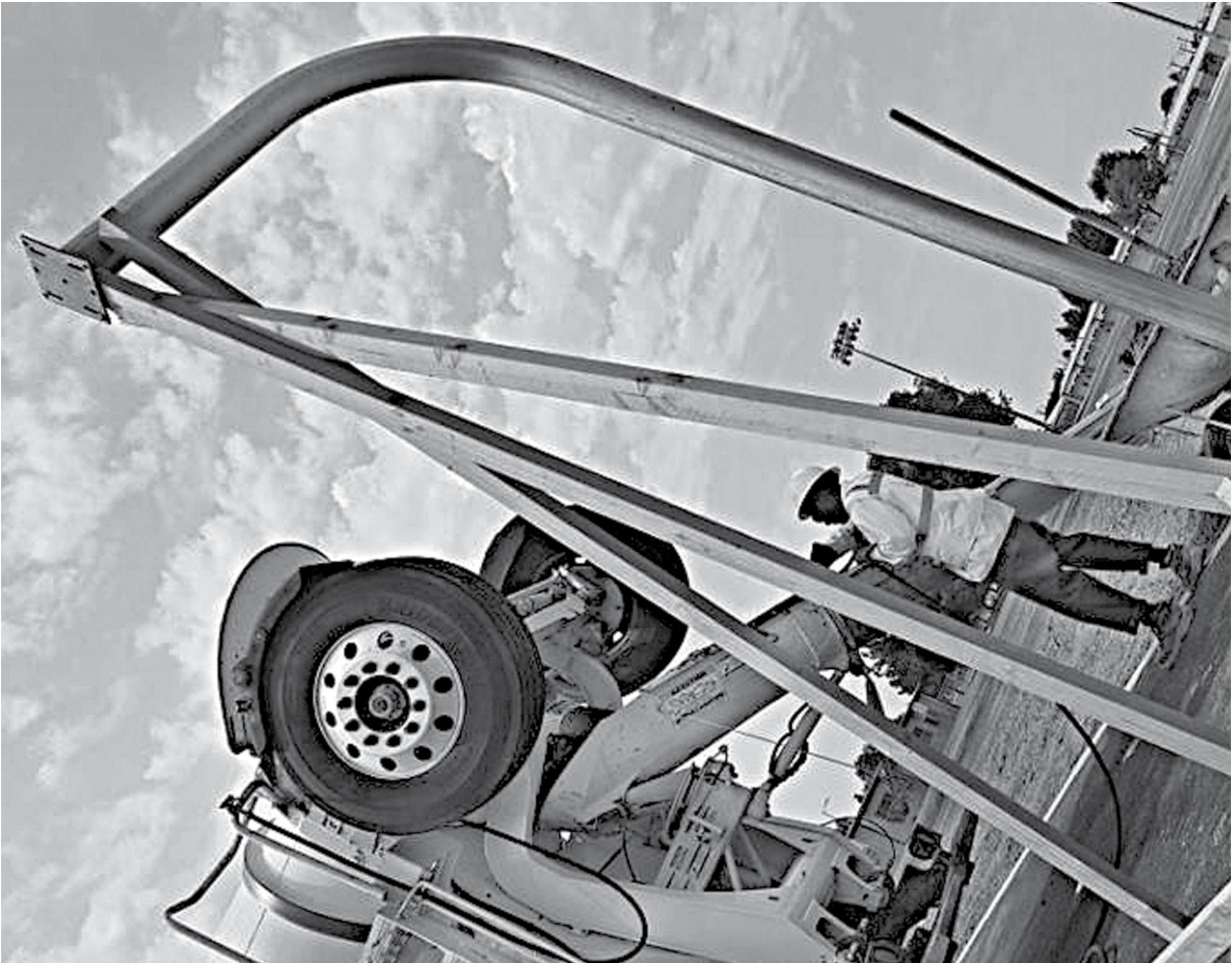
Crews recently put up new basketball poles and finalized work on the new blacktop at Lawndale’s FDR Elementary. Measure L monies paid for the project.