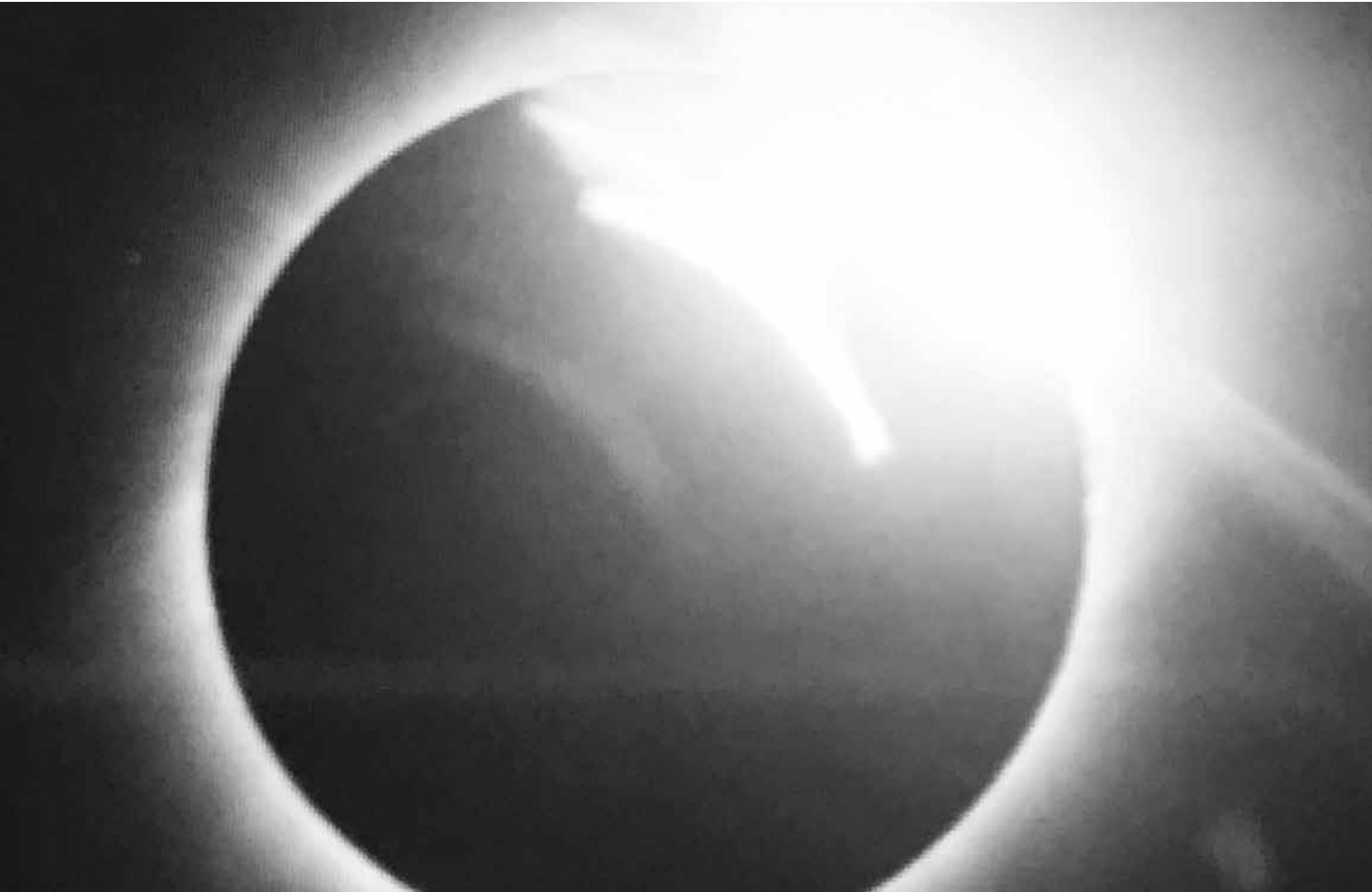
Though it didn't fully darken the South Bay skies, Monday's solar eclipse was still a sight to behold — provided you had safe viewing equipment.