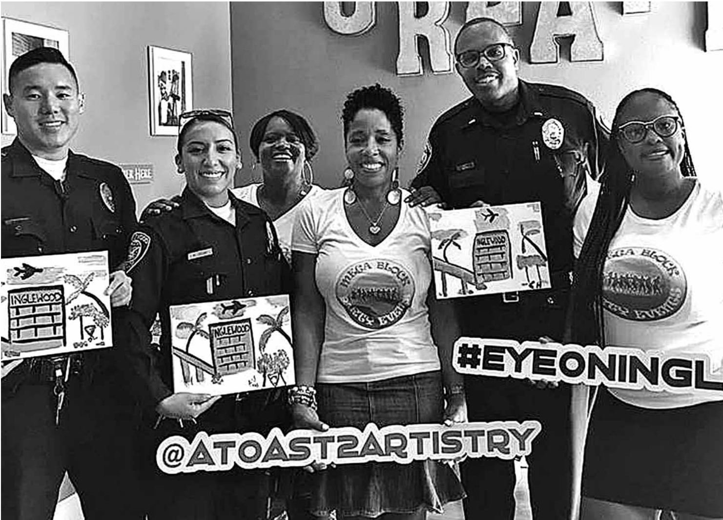
Members of the Inglewood Police Department participated in the A Toast 2 Artistry LA event at the first annual Mega Block Club Party. The festivities took place the afternoon of Aug. 25.