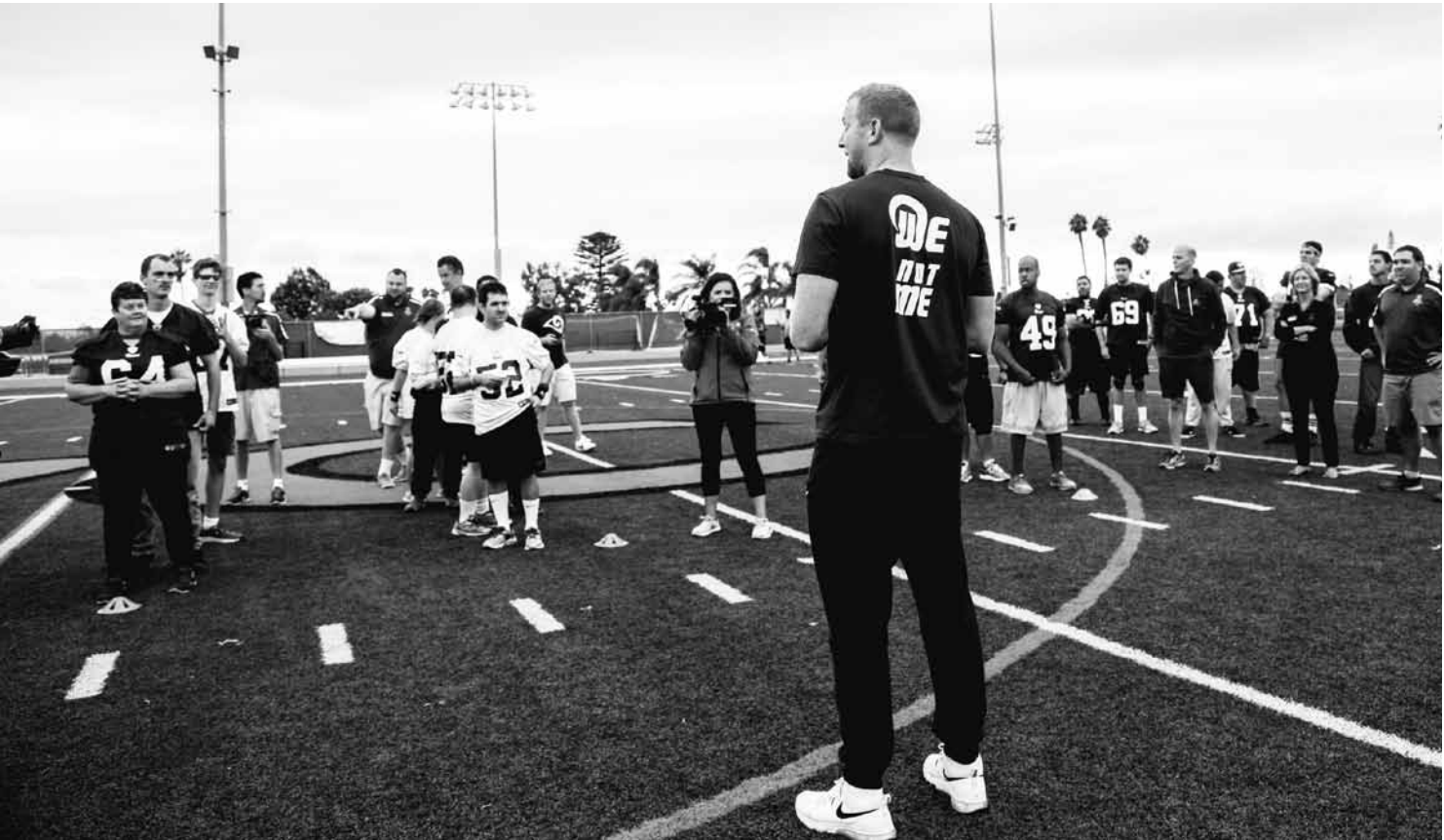
On September 14, the Los Angeles Rams and Special Olympics Southern California hosted a FUNDamentals Football Camp and Punt, Pass and Kick Challenge. The event featured 70 Special Olympics athletes and 15 coaches from Los Angeles, with a special appearance by Rams' all-pro punter Johnny Hekker (facing the group in the photo).