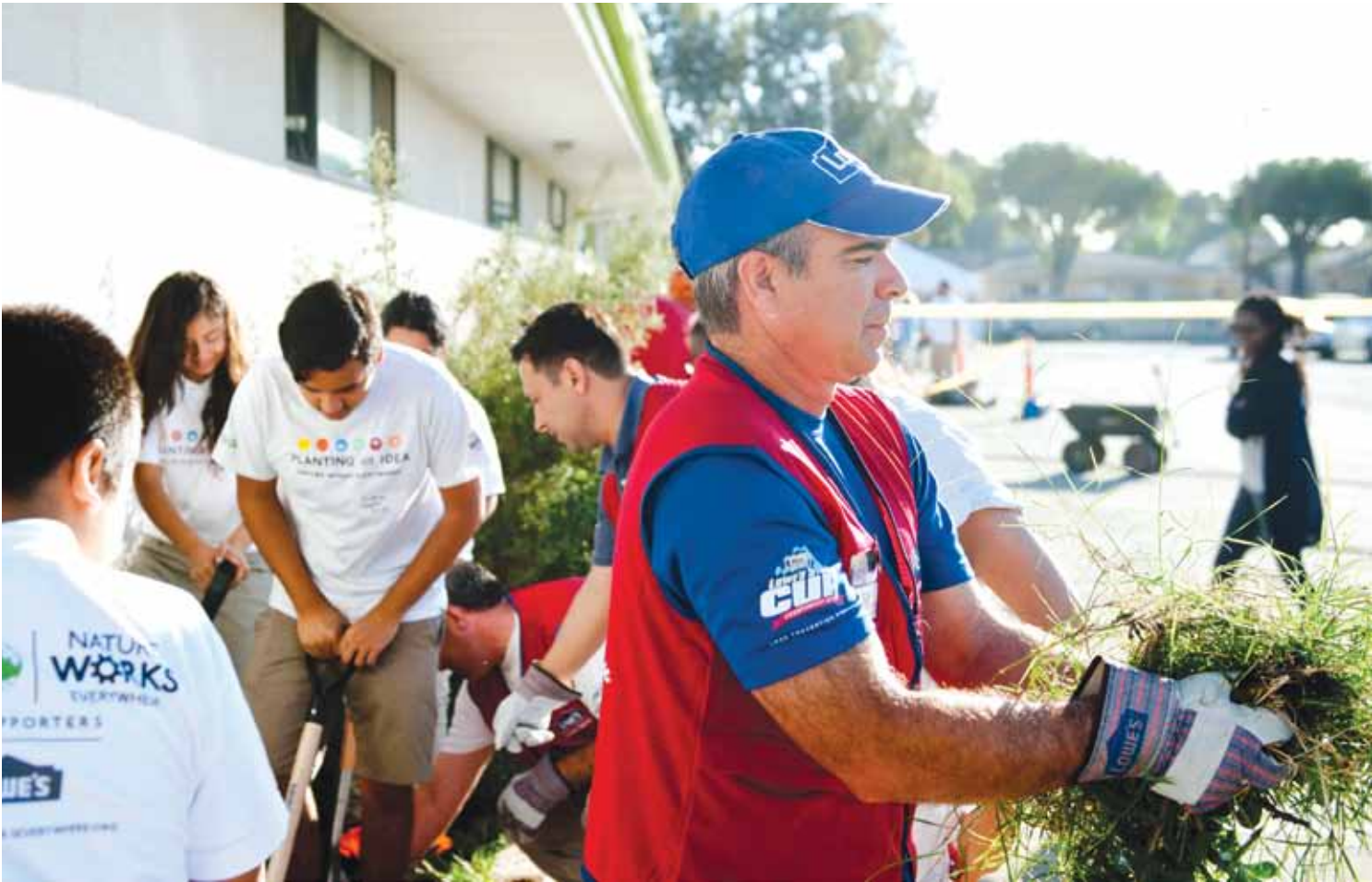
A Lowe's Hero Volunteer and students working together at the Environmental Charter School – Inglewood (ECMS-I). In partnership with Lowe's and ECMS-I, The Nature Conservancy conducted a one-day garden build Wednesday on the school's campus. The garden was built using drought-resistant plants native to southern California, allowing the school and its students to take action to address the drought in California. Environmental Charter Schools are located in South Los Angeles, and more than 80% of the students qualify for free and reduced lunch. Most will be the first in their family to go to college.