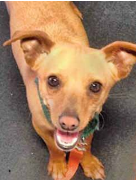
Mozart is sociable and perfectly polite.

my forever home. Everyone says that I'm a phenomenal little guy because I'm great on the leash and love to go on walks and runs. I'm happy to ride in the car with you, I'm also crate trained and if that's not enough, I'm adorable. Currently, I'm living in a cage-free environment that allows me to socialize and I do enjoy playing with my doggie pals. I'm a little overweight but should be back to my ideal weight of 10 pounds before too long. Like most dogs my size, I'm cautious around new people, but for those who have the patience to earn my trust, I exuberantly form deep bonds! Mozart can be seen anytime at Yellow Brick Road Doggie Playcare in El Segundo. Call 310-606-5507 or email southbaydoggie@hotmail.com for an appointment.