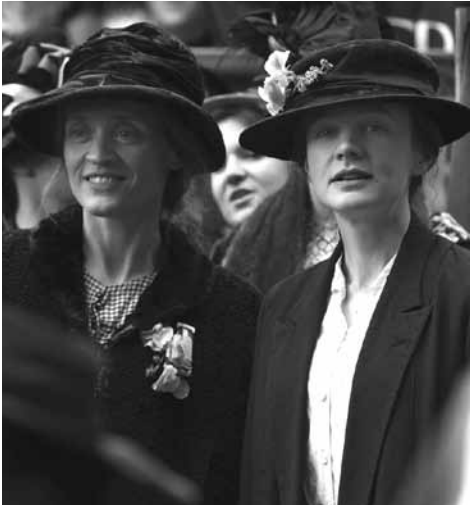
Anne-Marie Duff and Carey Mulligan in Suffragette . Courtesy of Focus Features

Blending fact with fiction, Suffragette tells the story of the strong-willed women in Britain who, in 1912, took a stand against the current political state to demand equal rights. They were rebels, activists, and heroes. When their peaceful protests were ineffective, these women turned to more public and violent displays to seek attention for their cause. Breaking