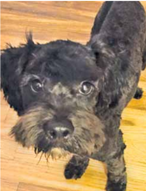
Licorice is a sweet boy who's black from head to toe.

If anyone knows why my previous owners would surrender an adorable, 18-month-old Miniature Schnauzer mix to LA city shelter, would you please let me know? Oh by the way, they call me Sammy and no one can figure out why I was unceremoniously dumped. I'm a super nice little guy, I LOVE to play, I get along great with other dogs and I'm just too cute to believe. I may be part poodle – not sure – but I have a very unusual colored coat that's mostly black with streaks of brindle. I'm only 13 pounds, which makes me very transportable, and I'll go everywhere with you. While I am a little too energetic and vocal for apartment living I would thrive in a home with a yard and another dog to play with. If you are interested in Sammy please email info@msfr.org for more information.