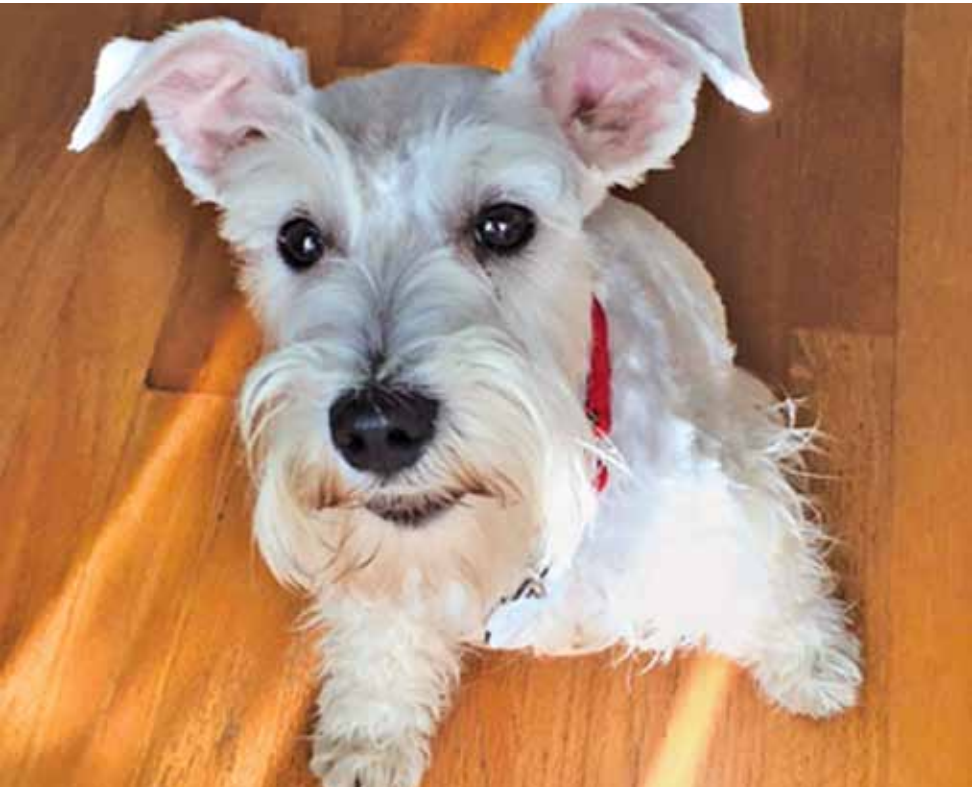
Elsa can give lots of love to her new family.

new family lost their senior dog in June and was looking for someone special to fill the hole in their hearts. We were thrilled to help them find the perfect match. Wishing them all many happy adventures.