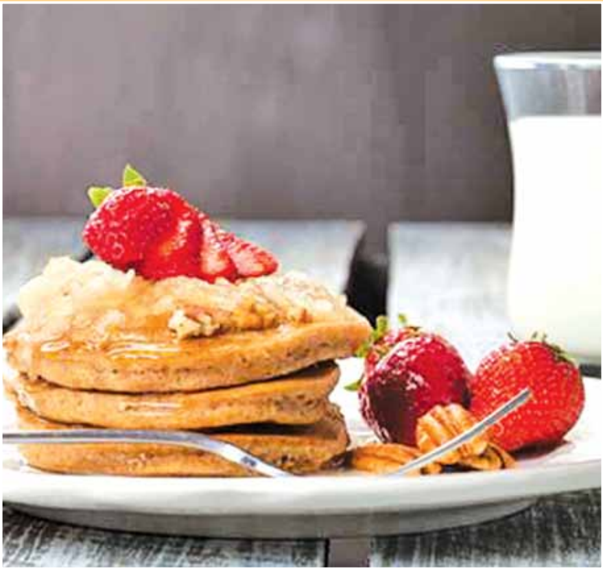
Makes 6 serving