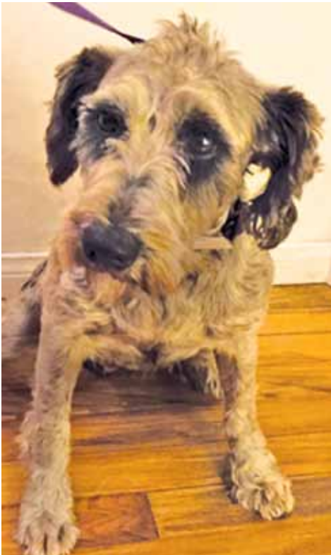
Willie would be perfect to cuddle up with.

We are looking for volunteers to help with our pet adoption fairs which are held every Saturday at the Petco located at 537 N. Pacific Coast Highway Redondo Beach 90277, from noon-3: 30 p.m. If you are interested in volunteering and can commit to at least one Saturday a month, please contact us at info@msfr.org . You can also visit all of our Miniature Schnauzers & Friends rescues at the adoption fair or check out our website, www.msfr.org . If you have any questions about a particular dog's availability you can email us at info@msfr.org . Schnauzers! Bet you can't adopt just one!