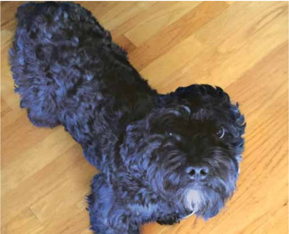
Sammy is an energetic puppy.

My real name is Mozart but my friends call me "Mosey." I'm a two-year old male Chihuahua mix who was rescued from the San Bernardino shelter. Last year I was adopted with my pal, Pepperoni, but our "parents" returned us when they had to downsize due to a divorce. Neither of us did anything wrong and we were kind of sad to go our separate ways. My pal has been rehomed so now it's my turn to find