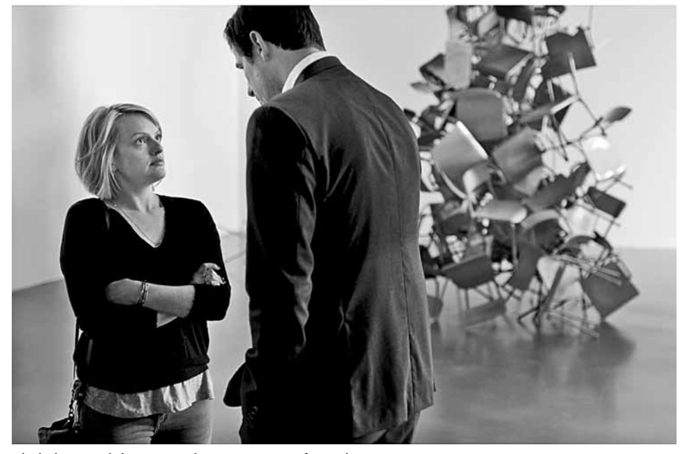
Elisabeth Moss and Claes Bang in The Square . Courtesy of Magnolia Pictures