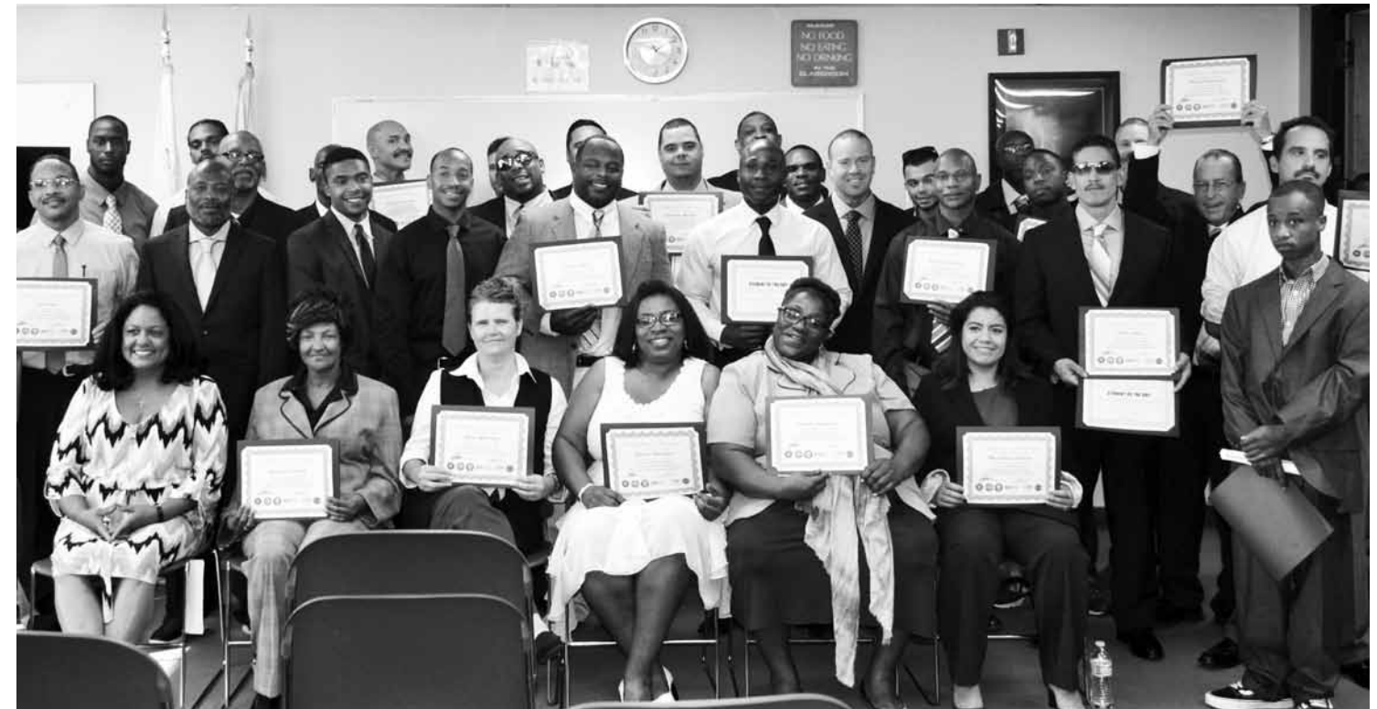
Thirty-six formerly incarcerated adults were proudly recognized on October 20 at the Inglewood One-Stop Business & Career Center for being the second group of parolees to graduate from the South Bay Workforce Investment Board's (SBWIB) week-long Career Pathways 180 Job Preparation Academy in cooperation with the Los Angeles Central Parole District.