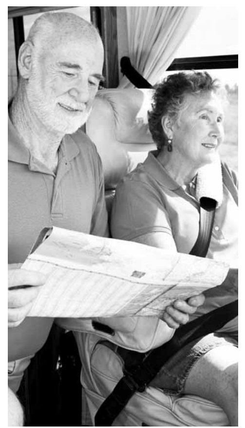
(BPT) - If you're turning 65 in 2017 or 2018, you're one of 10,000 people who become Medicare-eligible each day. Choosing Medicare prescription drug coverage can be confusing, especially for the first time. You may have questions about which plan fits your healthcare needs and budget or how to enroll. The good news is, it doesn't have to be overwhelming if you know these four rules.

Rule #1: Lower premium plans may mean higher costs. Plans with a lower premium may end up costing more in the long run if they have higher drug copays, which can really add up.