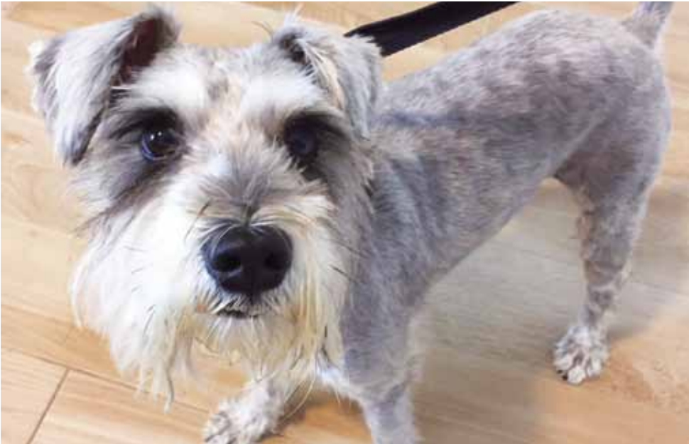
We are looking for volunteers to help with our pet adoption fairs which are held every Saturday at the Petco located at 537 N. Pacific Coast Highway Redondo Beach 90277, from noon to 3:30 p.m. If you are interested in volunteering and can commit to at least one Saturday a month, please contact us at info@msfr.org . You can also visit all of our Miniature Schnauzers & Friends rescues at the adoption fair or check out our website, www.msfr.org . If you have any questions about a particular dog's availability you can email us at info@msfr.org . Schnauzers. Bet you can't adopt just one.

Let me introduce myself, I'm Eugene , a 3-year-old male purebred Miniature Schnauzer. One night my brother, Banks, and I decided to go for a walk and visit some pals. The next thing we knew we were at an Inland Empire shelter and we were labeled as strays. So much for socialization! I love hanging out with other dogs and since, at 21 pounds, I'm larger than my brother I guess I'm the "big" brother. The shelter folks said we were 4 years of age but everyone thinks we act a lot more like 3 than 4. If you're looking for a handsome guy to enrich your life, I definitely would be the perfect companion for you! If you are interested in Eugene, please email info@msfr.org for more information.