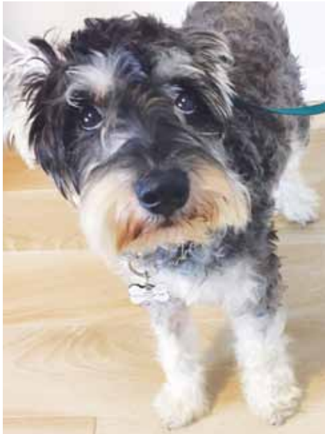
I am a 2-year-old male purebred Miniature Schnauzer. Not quite sure how it happened but I ended at an L.A. area shelter where everyone called me a stray. I heard that I was going to be adopted by someone but they must have changed their mind because no one ever came for me. Unbeknownst to me, the MSFR folks had heard my story and when it looked like I was going to be stuck at the shelter, they swooped in and rescued me. I'm a very good-natured pup who gets along with everyone. I'm still a youngster so I'm very playful but I have a really sweet

I believe that you've met my brother, Eugene, and heard our tale. I'm Banks , and at 17 pounds, I'm the "little" brother. I too am a male, purebred Miniature Schnauzer whose behavior more resembles that of a 3 year old than that of a 4 year old. Who would have