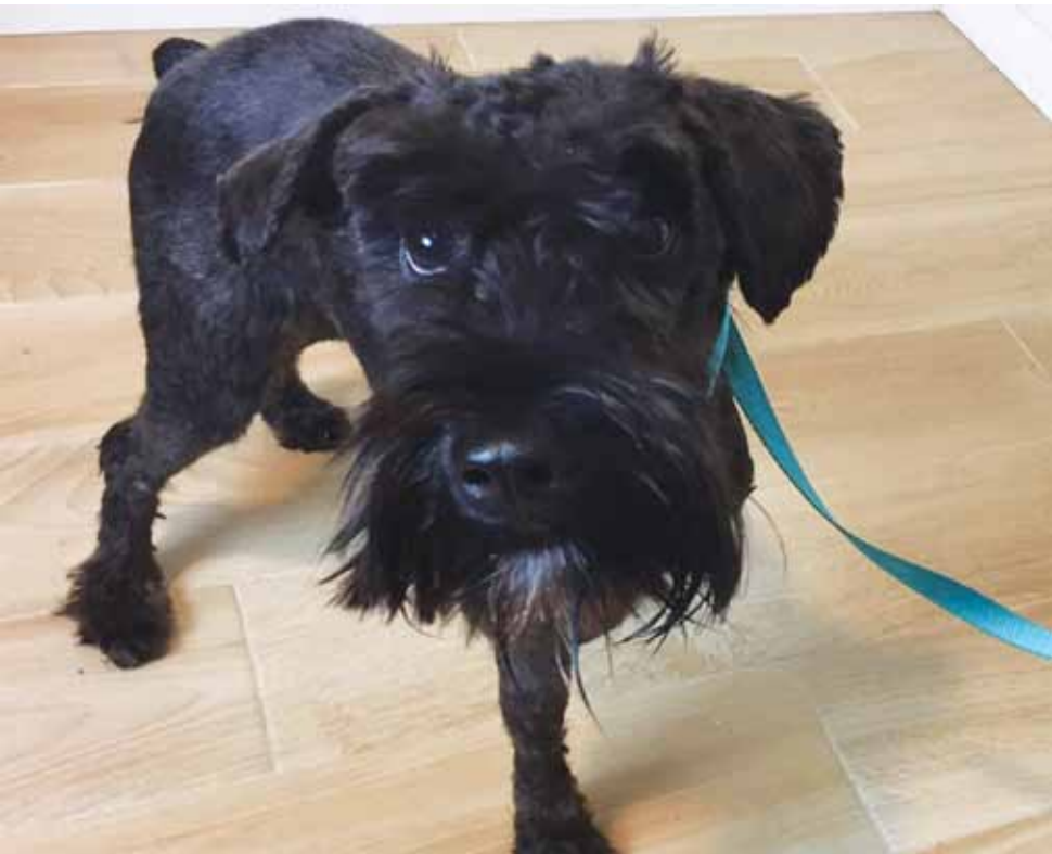
Ditto is one of two recent amputees, who were happily rescued and now part of a fun, new family!

Another celebration is in order. Congratulations to Ditto and his new family. Ditto is one of the two recent amputees, the other being Serena, who were rescued from a shelter shortly after the 4th of July. In addition to being avid MSFR supporters, Ditto's new Mom and Dad are also extended family of a