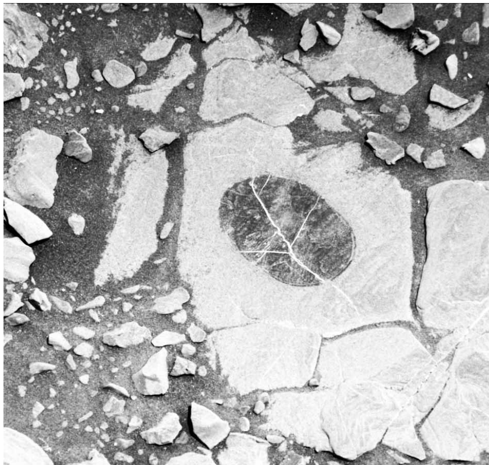
This false-color image demonstrates how use of special filters available on the Mast Camera (Mastcam) of NASA's Curiosity Mars rover can reveal the presence of certain minerals in target rocks.

a planned destination for Curiosity before the rover landed five years ago. Spectrometer observations from orbit revealed hematite here. Most hematite forms in the presence of water, and the mission focuses on clues about wet environments in Mars' ancient past. It found