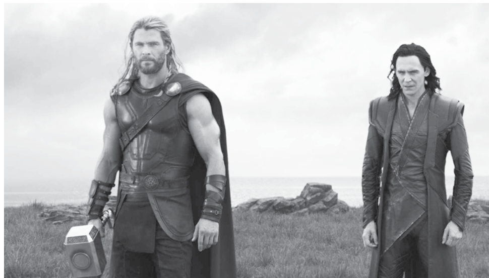
Chris Hemsworth and Tom Hiddleston in Thor: Ragnarok.

Thor: Ragnarok is rated PG-13 for intense sequences of sci-fi violence and action, and brief suggestive material. 130 minutes. Now playing in theaters everywhere. •