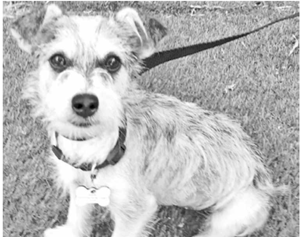
Pinky is outgoing and sweet.

shelter where they said I was a stray. I do shed some but what are a few hairs among friends? Especially when I have so many other things going for me. I'm friendly, good with other dogs, outgoing, quiet and just too sweet to be real. I'm tired of living alone and am ready to share my life with my forever family. If you are interested in Pinky please email info@msfr.org for more information.