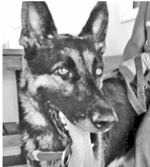
Thorin ready for fun!

shelter where they said I was a stray. I do shed some but what are a few hairs among friends? Especially when I have so many other things going for me. I'm friendly, good with other dogs, outgoing, quiet and just too sweet to be real. I'm tired of living alone and am ready to share my life with my forever family. If you are interested in Pinky please email info@msfr.org for more information.