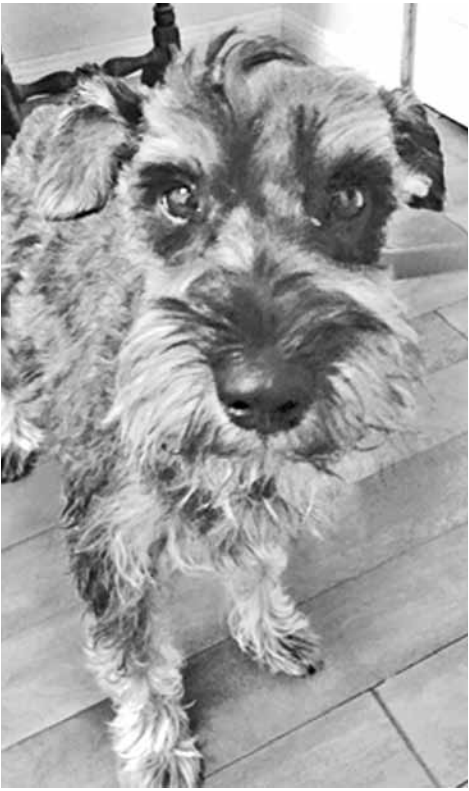
Harper is in need of a kind family of his own.

We are looking for volunteers to help with our pet adoption fairs which are held every Saturday at the Petco located at 537 N. Pacific Coast Highway Redondo Beach 90277, from noon-3: 30 p.m. If you are interested in volunteering and can commit to at least one Saturday a month, please contact us at info@msfr.org . You can also visit all of our Miniature Schnauzers & Friends rescues at the adoption fair or check out our website, www.msfr.org . If you have any questions about a particular dog's availability you can email us at info@msfr.org . Schnauzers! Bet you can't adopt just one!