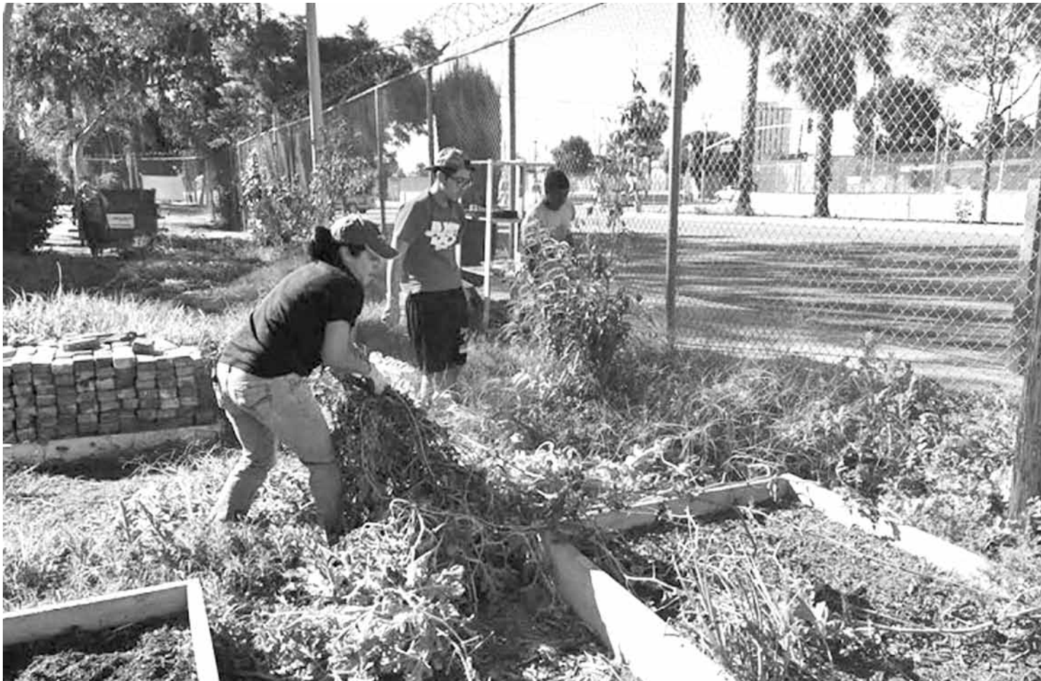
50-60 parents and children attended the cleanup at the Youth Activities' League garden planting at the Compton YAL garden. The Sheriff's Youth Foundation of Los Angeles County assists at-risk youth in Los Angeles County through sports programs, homework assistance, and emotional havens for troubled teens. Visit sheriffsyouthfoundation.org for more details.