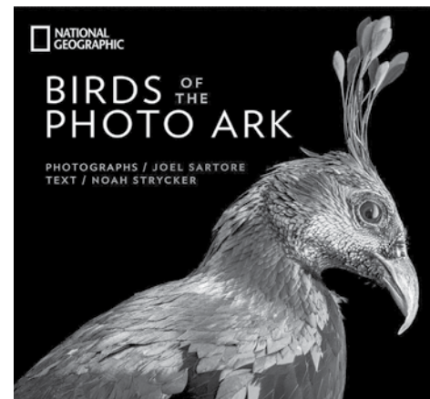
Birds of the Photo Ark by Noah Strycker and photographs by Joel Sartore.

the main draw of these books are the photos. Pages and pages of beautiful portraits of insects, birds, reptiles and mammals... every kind of creature you can think of. You can drink in these pictures for days and then return again to them and find something new. You can definitely relate to these animals. They tug at