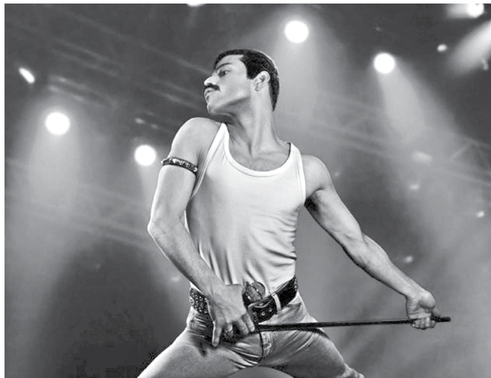
Bohemian Rhapsody

Queen was a band of misfits and they were universally embraced because of their authenticity. It was their creative spirits and steadfast dedication to musical exploration and inventive storytelling -- fronted by an enigmatic