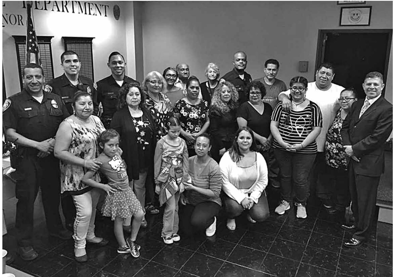
Last week, members of the Alliance Neighborhood Watch Group prepared dinner and shared a meal with our officers as a thank you for their service to the community.