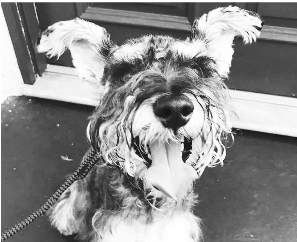
Ozzie's smile says it all!

We're absolutely thrilled to congratulate Ozzie and his new family. Ozzie was formerly known as Neo, our rescue from January 2016 who had to have his leg amputated due to a severe injury. He was rehomed in February 2016, but sadly his adopter fell upon financial hard times. She had to relocate with family members and couldn't take Ozzie with her. Fortunately, we were able to find him a great home with a wonderful