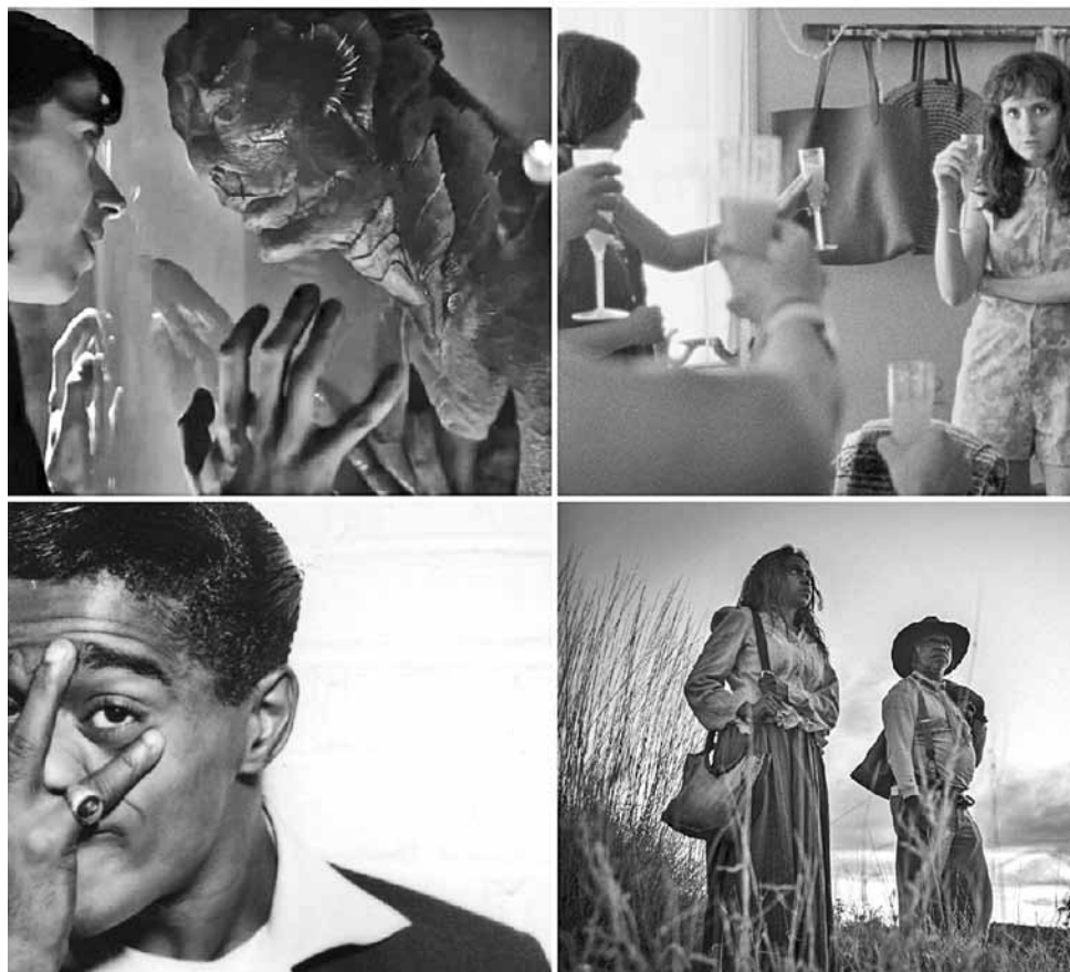
(L-R) The Shape of Water , Mr. Roosevelt , Sweet Country , Sammy Davis, Jr.: I've Gotta Be Me

1960s Cold War America and the beast is an amphibian-man wanted for use as a weapon by both U.S. and Russian intelligence. This is essentially Guillermo Del Toro's latest film, The Shape of Water . You have the outline, however. The special ingredient to this magical film is that it's an unapologetic fantasy romance, lush and loving in a way