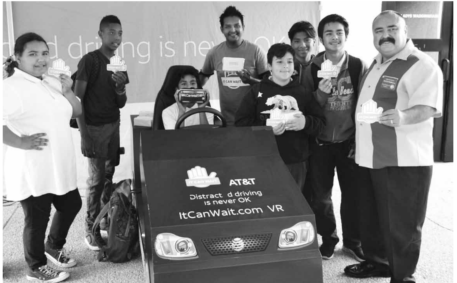
Inglewood City Councilman Alex Padilla (far right) visits with youth as they participate in AT&T's "It Can Wait" awareness program at the Inglewood Teen Center on November 1. The youth experienced a virtual reality driving lesson that demonstrates what can happen if you use a smartphone while operating a vehicle. They then took a pledge not to practice distracted driving in the future.