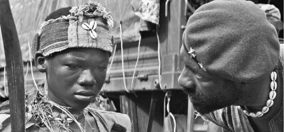
Abraham Attah and Idris Elba in Beasts of No Nation.

isn't. He's charismatic, he expresses interest and care in his soldiers, and he gives them a reason to fight. It's even more terrifying that he is impressionable and even affable than if he were a terrorizing menace: in this