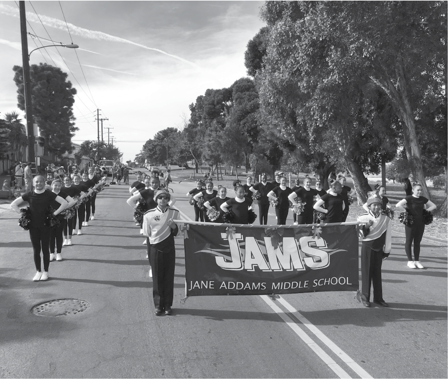
The Jane Addams Mighty Marching Bengals, comprised of band, RAP drumline and cheer, won first place honors for Middle School Band at last month's El Segundo Holiday Parade.