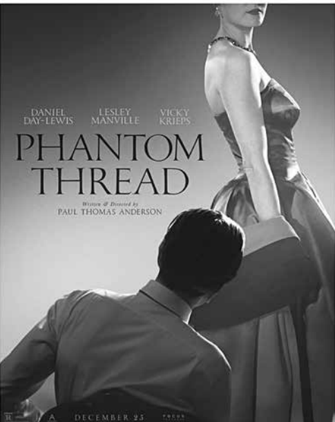
Phantom Thread courtesy of Focus Features.