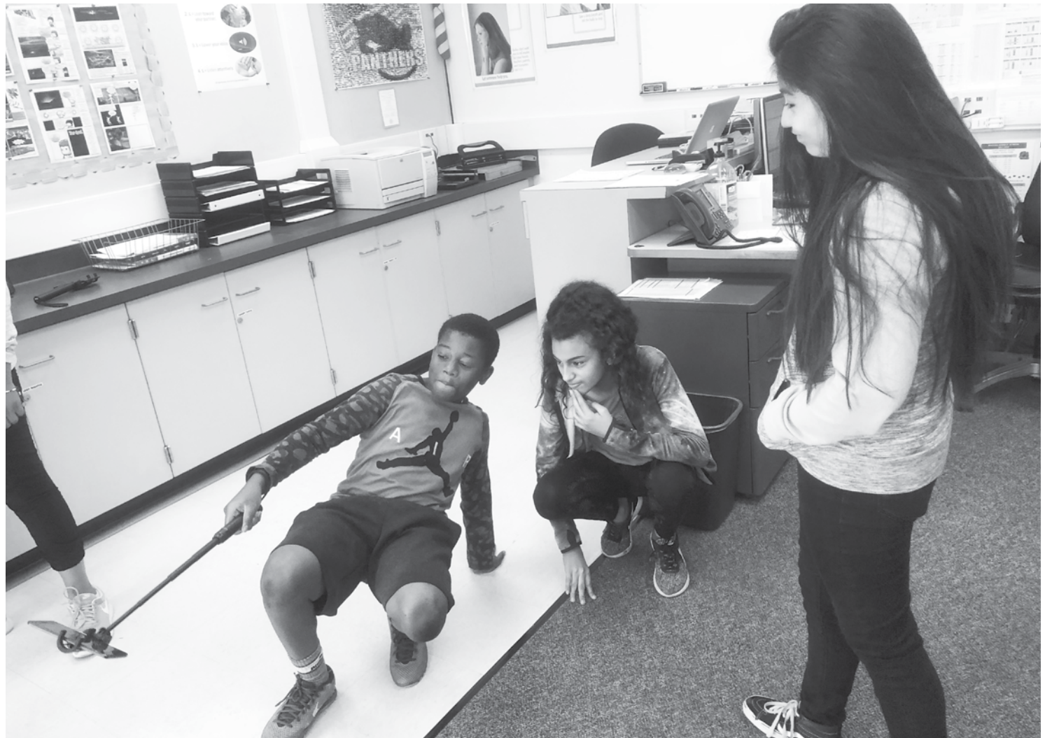
Google recently brought augmented reality via Google Expressions to enhance learning and engage Will Rogers and Jane Addams Middle School students. Lawndale Elementary School District.