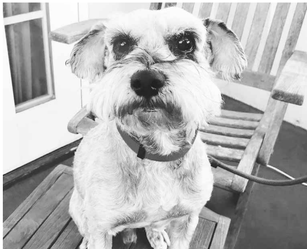
Congratulations to Pilgrim and his new family.

Congratulations to Pilgrim and his new family. We knew this guy was going to be something special to the right family and he sure is. His new family was heartbroken when they lost their 13-year-old "Schnoodle" to cancer several months ago. They decided they needed another dog to help heal their hearts and so they began their search. When they met Pilgrim, it was love at first sight. The little ham was irresistible with all of his pawing for attention, his facial expressions and