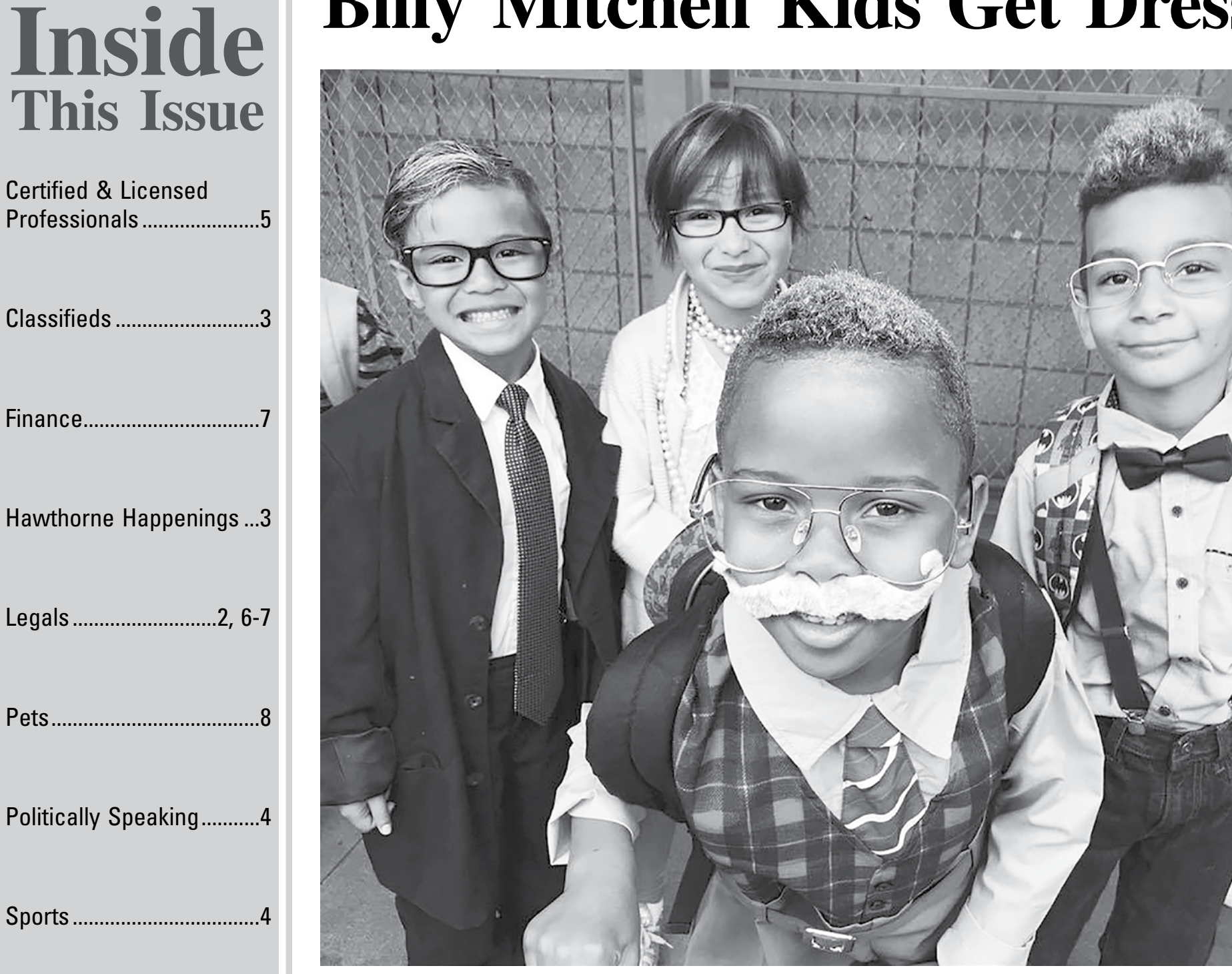
Last Friday, kindergarteners at Billy Mitchell Elementary celebrated the 100th day of school with some costume flair.